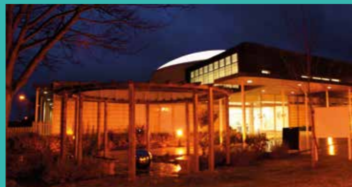
Community Healthy Living Centre, Thetford, Norfolk. Developed by Guildhouse