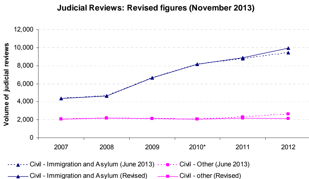
Figure 1: Impact of revised figures, 2007 - 2012

* Due to a technical issue the number of JRs in the tables undercounted by two cases. The underlying data is the supporting csv file was correct.