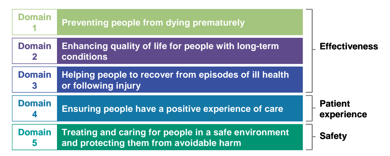
FIGURE 2: The domains of the NHS Outcomes Framework

The purpose of the NHS Outcomes Framework is threefold: