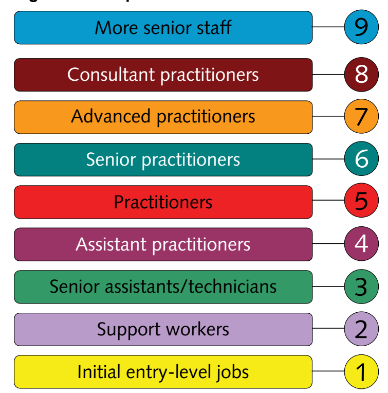
Figure 3: Competence-based career framework and tools

Similarly, the clinical academic training pathway is consistent with the competency based career framework for allied health professionals shown in figure 3 below.