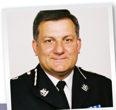
Ian Arundale, Chief Constable Dyfed Powys Police