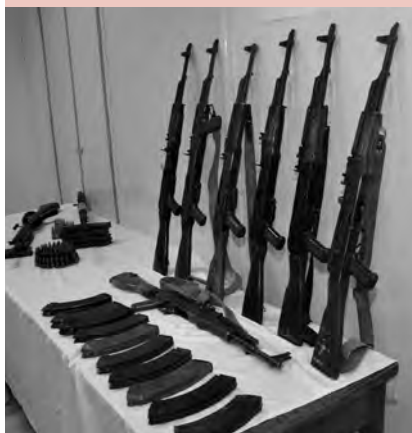
Weapons seized in the neighbourhood of Mnihla, 2013.