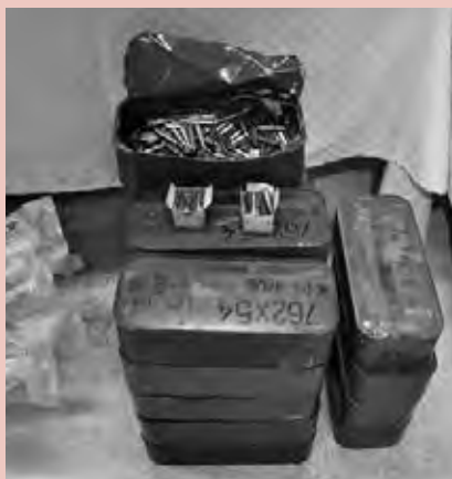
Ammunition seized in the neighbourhood of Mnihla, 2013.