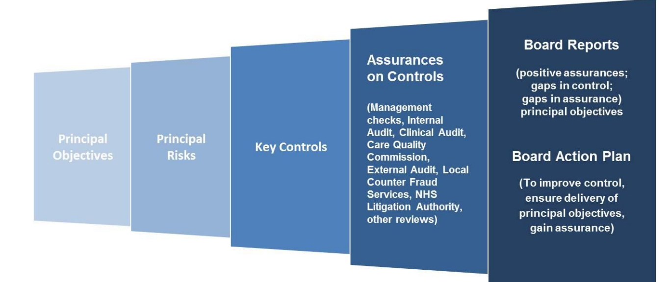
Figure 5: Key elements to the Board Assurance Framework

105. The BAF provides trusts with a simple but comprehensive tool for assessing the effectiveness of their management of the principal risks to meeting their objectives. It should also provide a structure for the evidence to support the Annual Governance Statement. It is designed to simplify board reporting and the prioritisation of action plans, which, in turn, allow for more effective performance management. The main elements are set out below.