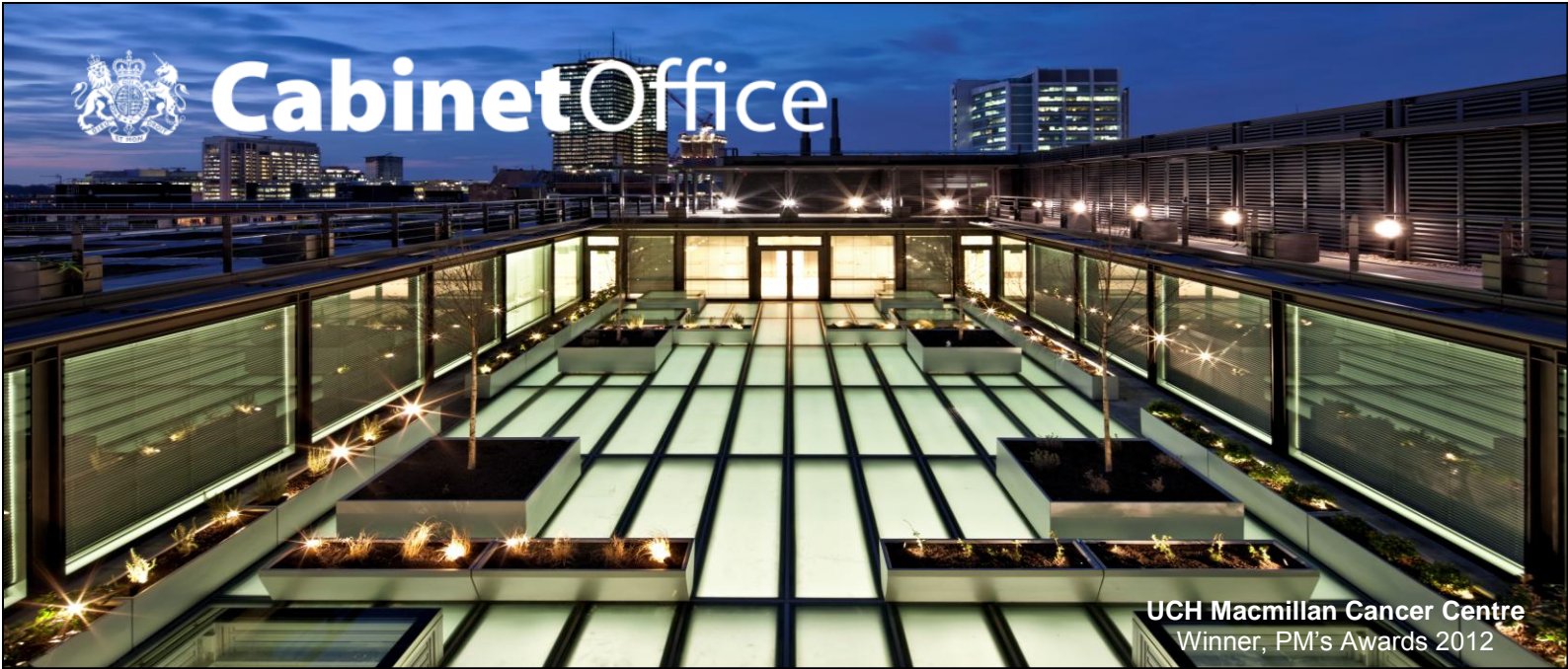
UCH Macmillan Cancer Centre Winner, PM's Awards 2012