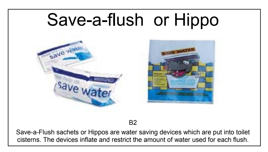
Figure 1.1: Showcard from discussion group