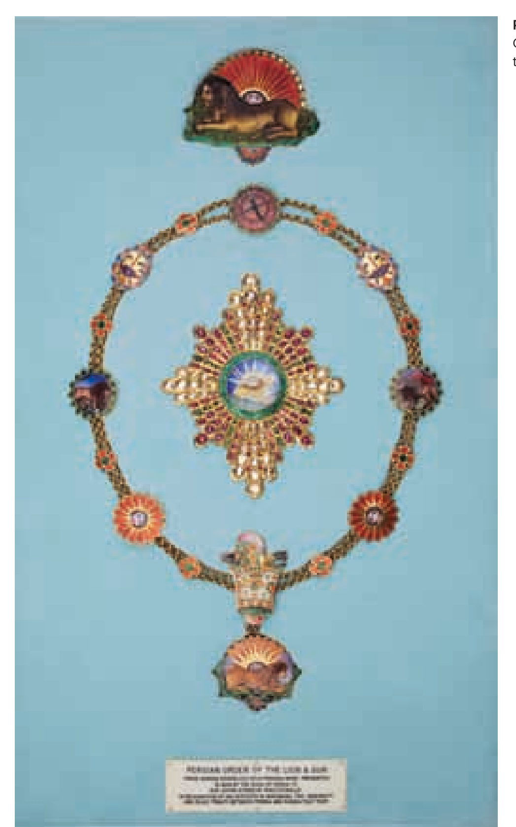
Plate XV Insignia of the Order of the Lion and the Sun