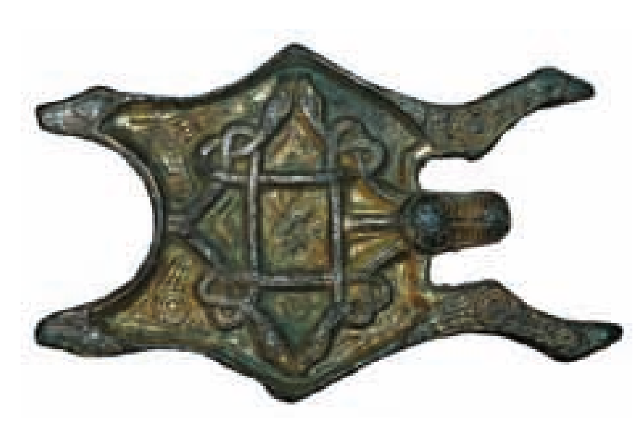
Plate XI The Courtenay Compendium Plate XII An Insular copper-alloy animal mount