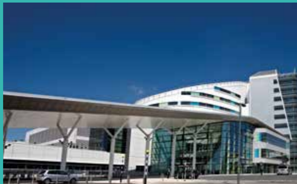
Queen Elizabeth Hospital Birmingham