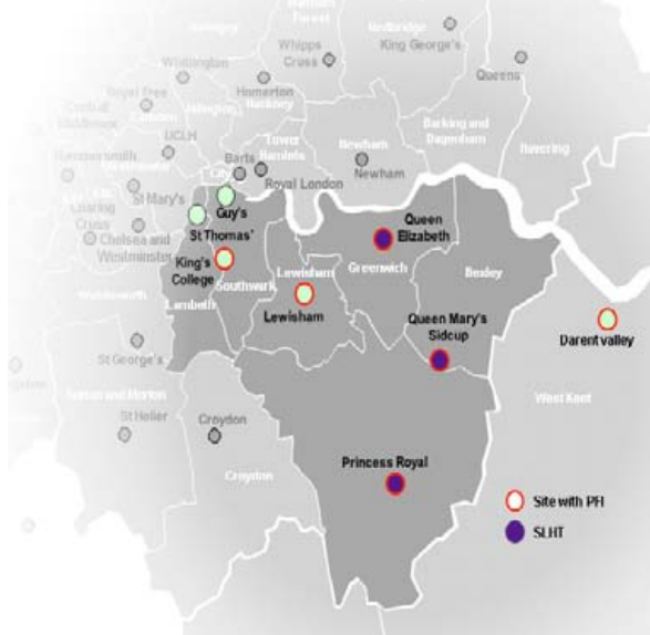
Figure 1: Map of acute hospitals in south east London