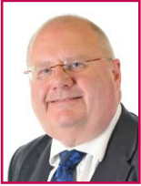
Rt Hon ERIC PICKLES MP UK Secretary of State for Communities and Local Government