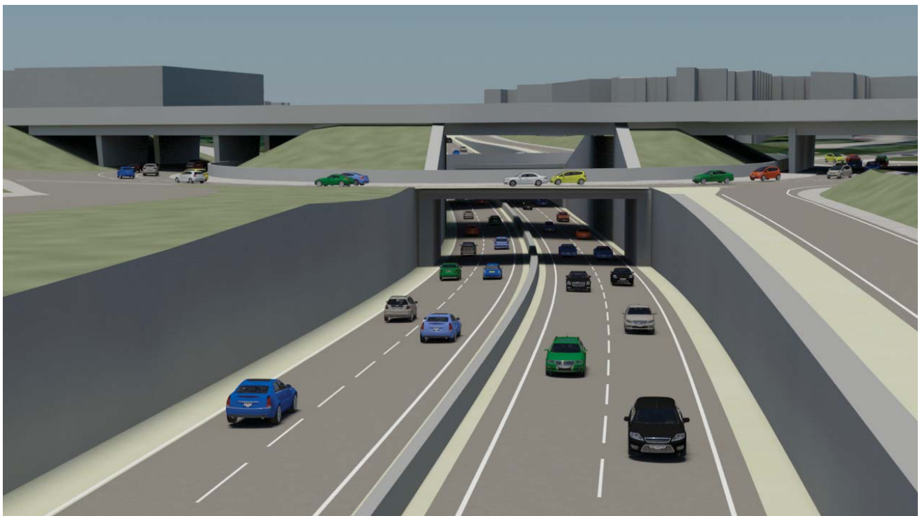
View of proposed junction looking North