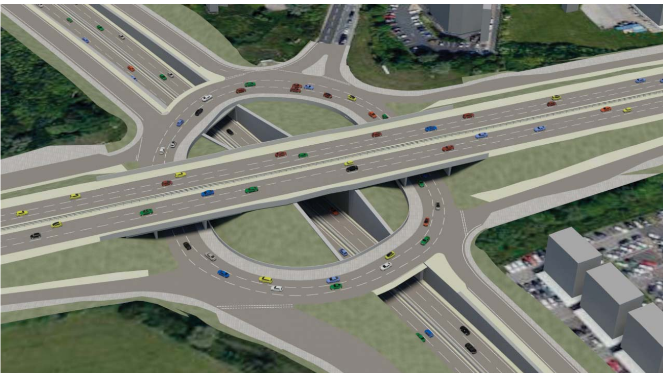
Overview of proposed junction