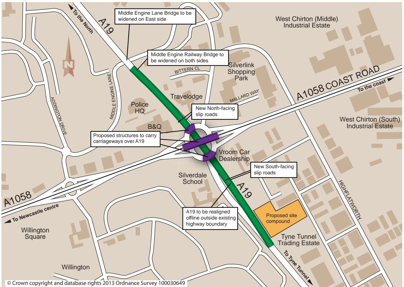
The proposed route