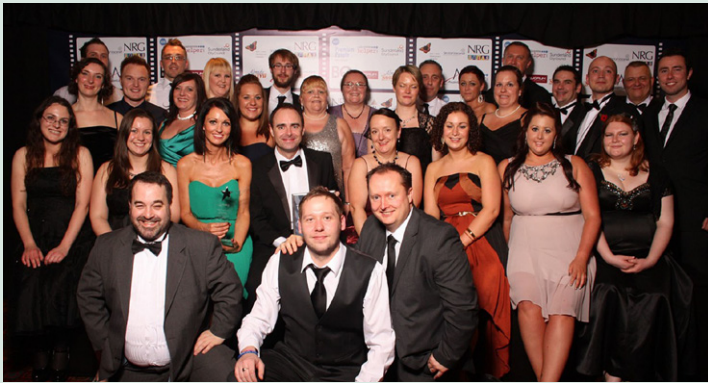
The NHSBSA North East Contact Centre team with their award.

The NHS Dental Services Helpdesk is one of the services provided by the NHSBSA's Contact Centre and at the recent North East Contact Centre awards the NHSBSA won the overall Contact Centre of the Year award. The Contact Centre was recognised for their excellence in a number of categories including delivering an outstanding customer experience.