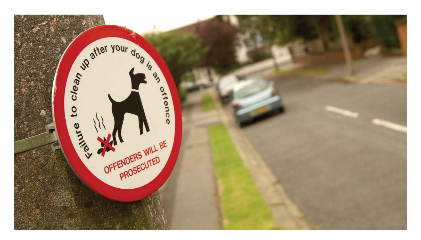
Challenge 5: Targeted communication, campaigning and enforcement