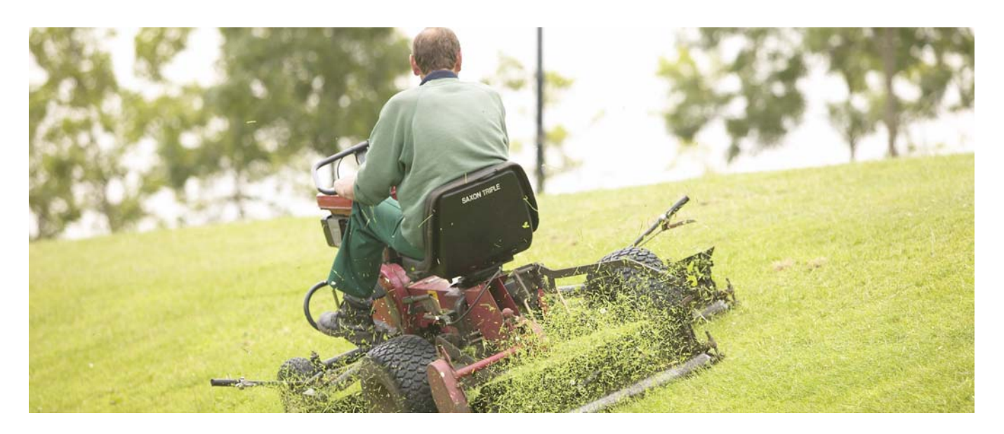
Action Point 6 – Develop corporate strategies, policies, procedures and design standards

Areas where councils could achieve greater efficiency by becoming more 'joined-up'