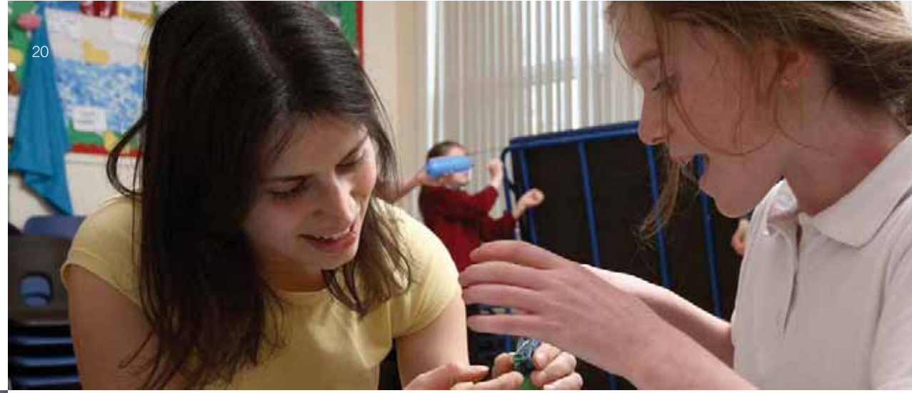
Dstl Annual Report 2006/07 Corporate social responsibility