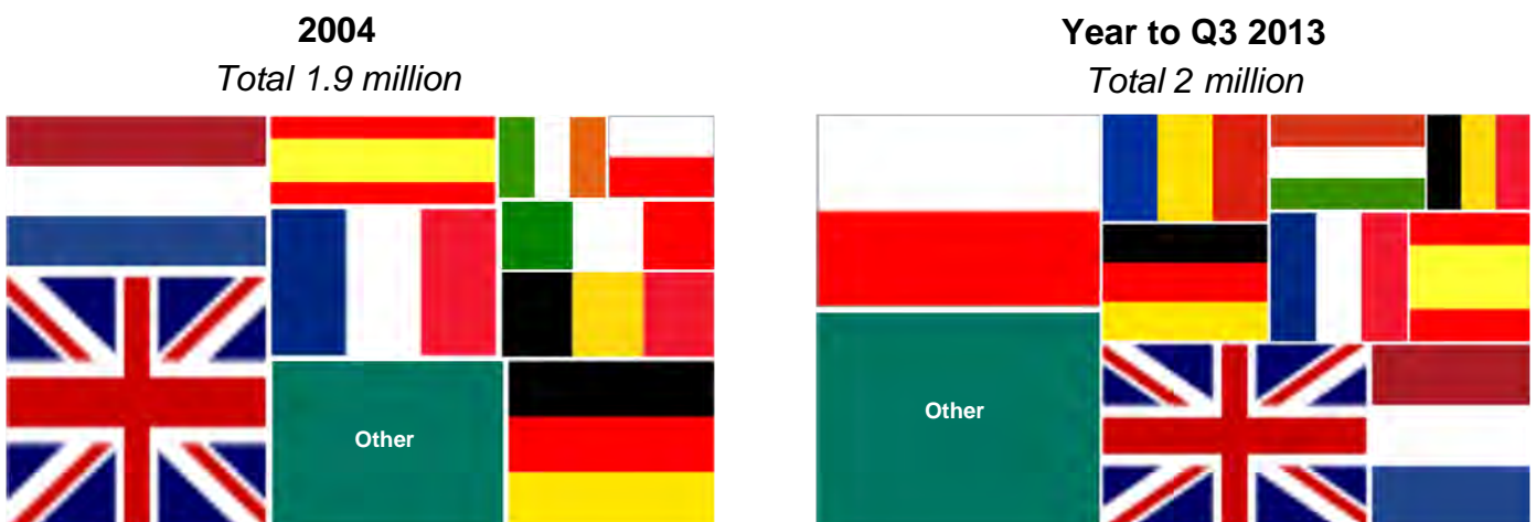
Chart 2: Powered vehicles travelling from GB to mainland Europe, percentage share by country of registration, 2004 versus year ending Q3 2013

Key: Flag size represents the proportion of total powered vehicles