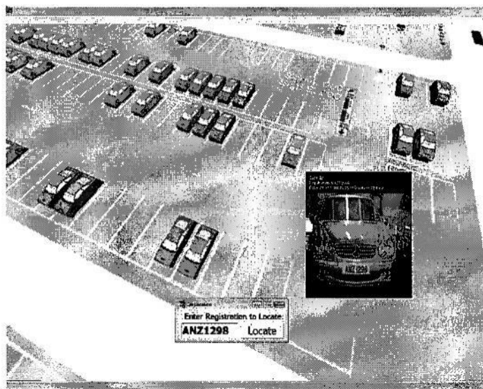
Vehicle location screen showing vehicle location after entering the license plate details.

The software is currently being developed for the Car Finder Kiosk for customer interaction and therefore not available for display. Images below are the back office screens.