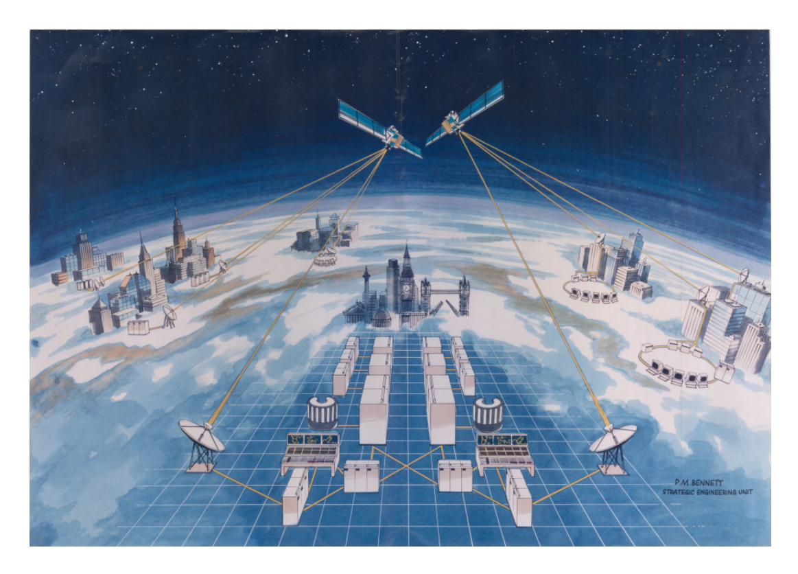
Figure 2. The markets of the future, as seen by the Strategic Engineering Unit of the London Stock Exchange (c. 1986)