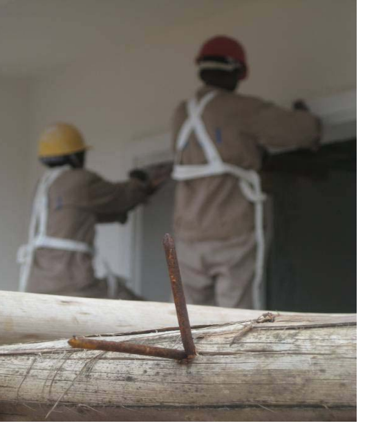
Photo 1: Example of hazards on a building site in Dar es Salaam. In addition to the nails, workers are wearing harnesses but these are not anchored.

demonstrate to contractors that H&S should not be seen as something which is just a "net cost" to contractors but rather that there can be financial benefits to investments in health and safety. Project staff and consultants have specific experience in this area; for example, a consultant to the project worked successfully with a large Tanzanian contractor to improve health and safety regulations within the company. This company is now widely recognized as one of the best contractors in terms of H&S in the country and the company