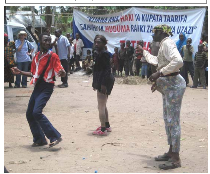
Photo 4: Trained local comedians raising awareness of HIV and AIDS in Bagamoyo

carried out through the use of local comedians who perform skits on key issues, as well as through the use of BCC and IEC materials. The project specifically targets youth aged between 10 and 24 and aims to raise their awareness of SRH and sexual and reproductive rights (SRR) through both general sensitisation and through the use of Peer Educations (PEs) who have been trained through the project. The project's advocacy work builds on awareness-raising and targets decision-makers both within communities (e.g. elders) as well as local government agencies. At the community level, advocacy work is focused on changing attitudes towards ASRH among "champions" (community leaders who are willing to act as advocates for change) so that they support the extension of SRH services to young people and do not serve as barriers to accessing the services. At the District level, the project has worked with authorities to integrate ASRH into District