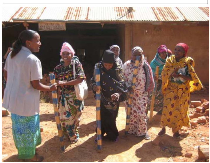
Photo 3: Upendo Women's Group with KWIECO Project Coordinator (far left)

project aims to help destitute women to obtain a livelihood through a range of inputs including enabling women to access training (including enterprisebased training), and market information; the provision of guidance and advice on business planning, job seeking and links to employers, as well as disbursing revolving loans which are provided to enable women to develop micro-enterprises. Awareness-raising campaigns and sensitisation