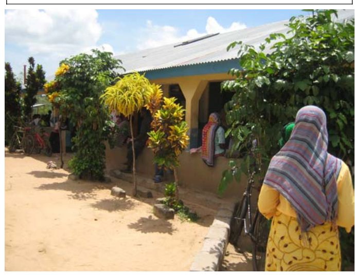
Photo 5: Women waiting for services outside a Government-run clinic in Bagamoyo. MSI provides support and training to the clinic.

Within this project, MST has been providing training both to their own staff and staff at Government clinics in order to improve the provision of youth-friendly SRH services. This is to ensure that staff are aware of government standards for the delivery of youth-friendly services and are able to work towards meeting these standards. The project is also building the capacity of Tanzanian journalists to report on SRH issues, and provides them with some training and awareness-raising. These journalists are linked to aspiring young journalists within target communities who also have their capacity built both in relation to journalism and ASRH.