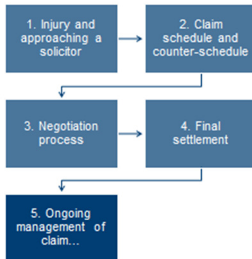
Figure 4.1: Stages in the personal injury claims process

This chapter summarises the different stages of the personal injury claims process, as outlined by stakeholders, claimants and deputies, with reference to the role of the discount rate in this process. Figure 4.1 gives an outline of each of the key stages in this process. Chapter 5 provides important context about claimants' preferences for the different types of settlement and their experiences of spending and investing their compensation, while chapter 6 presents the findings on ongoing claim management (stage 5).