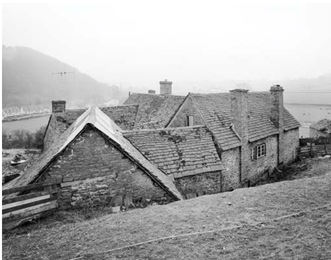
Clockwise from top left: The rear elevation of the building; Llwyn Celyn's main entrance, facing onto the farmyard; a view over the back of the house and the Llanthony Valley; a fine medieval doorway inside the building