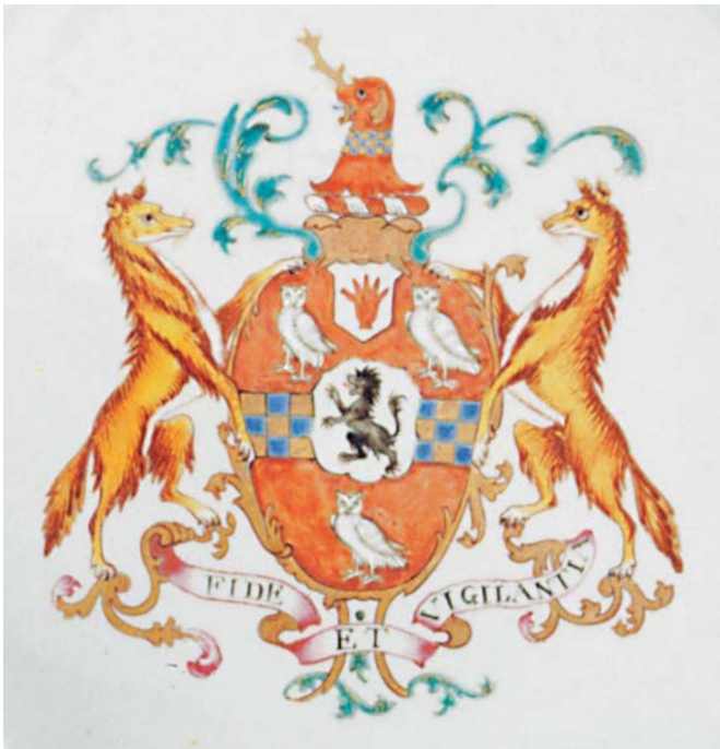
The Stepney coat of arms painted on a plate (above), and items from the octagonal dinner set (right)