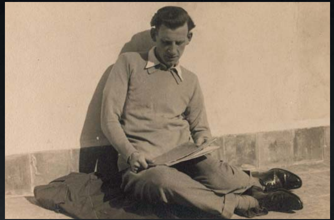
Siegfried Sassoon in Sicily, in the winter of 1929–30 (above), and items from the Sassoon archive

The archive was in the possession of the poet's son until his death in 2006, and was considered the most important collection of any major WWI poet's papers still in private hands. It was offered for sale to Cambridge University, where Sassoon had been an undergraduate and which already held a significant collection of Sassoon's papers. Cambridge University Library launched a successful fundraising campaign to which many funders and individuals contributed. The most significant contribution was from NHMF, in recognition of the outstanding importance of the archive and the need to preserve it for the nation. The archive also serves as a fitting memorial to those who have given their lives for the UK.