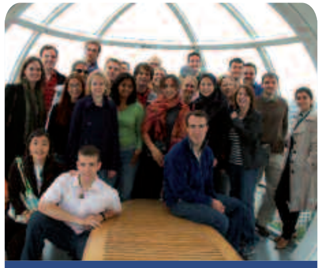
2008 Scholars on the London Eye