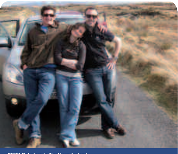
2008 Scholars in Northern Ireland