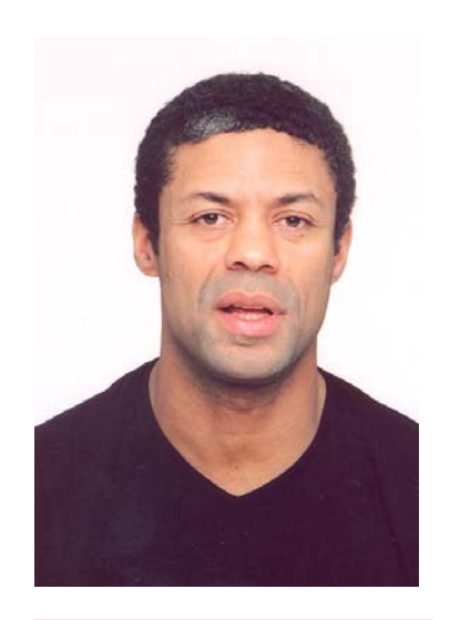
Not acceptable Opening the mouth distorts the normal facial features