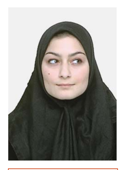
Not acceptable Although facing the camera, the subject is not looking directly forward