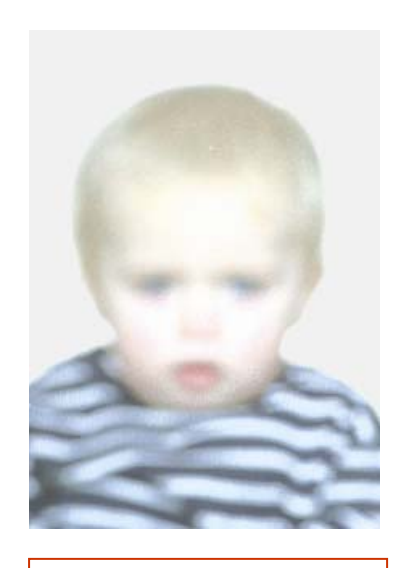
Not acceptable The photograph is too blurred to capture any facial detail