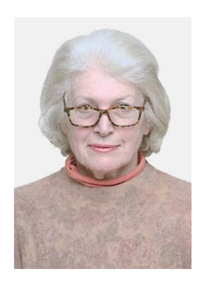
Not acceptable The glasses cover the eye

The following examples would be rejected by our staff as they do not conform to either the Identity & Passport Service, or internationally agreed standards: