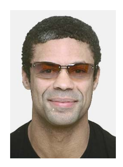
Not acceptable Dark glasses obscure the eyes, and smiling