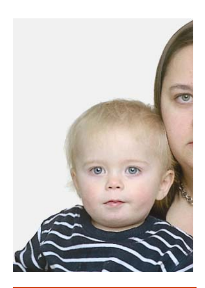
Not acceptable The photograph contains more than one person