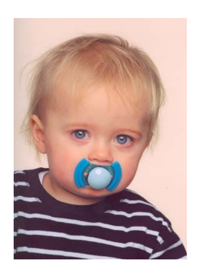
Not acceptable Any dummies should be removed before the photo is taken