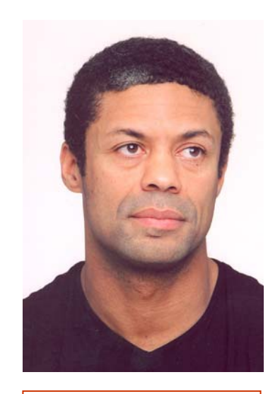
Not acceptable The subject is neither facing or looking directly forward