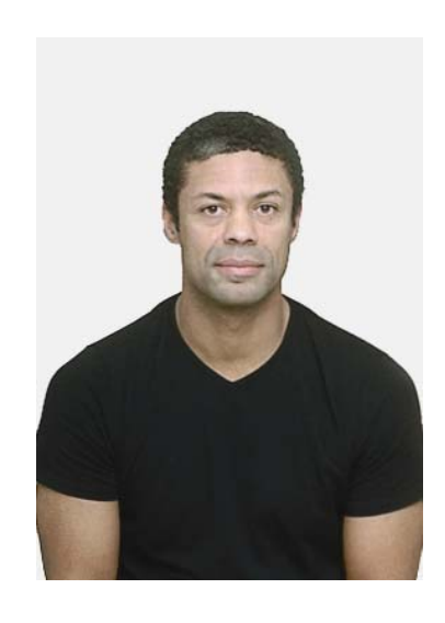
Not acceptable The subject is too far from the camera