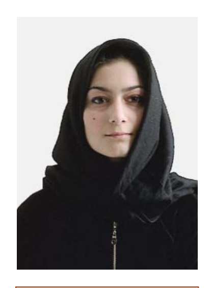
Not acceptable The scarf creates a shadow, which obscures the facial detail