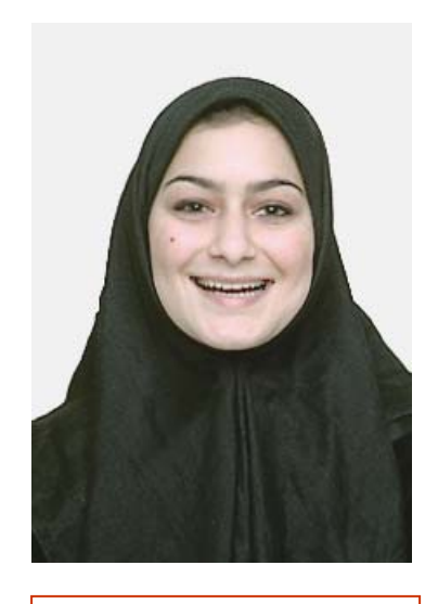
Not acceptable Laughing or smiling distorts the normal facial features