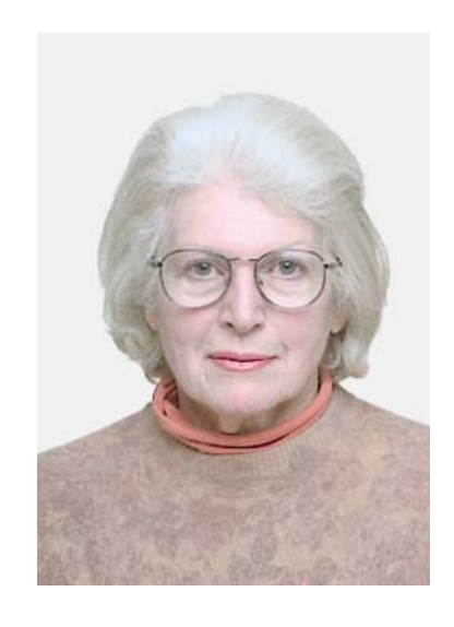
Acceptable Where possible, it is preferable to remove glasses to avoid any possibility of your photo being rejected