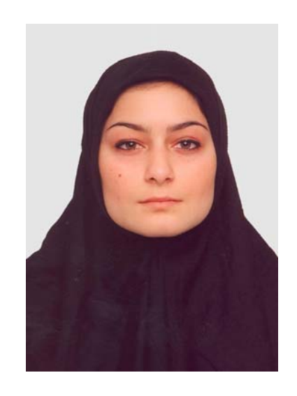
Acceptable Head coverings for religious or medical grounds are allowed