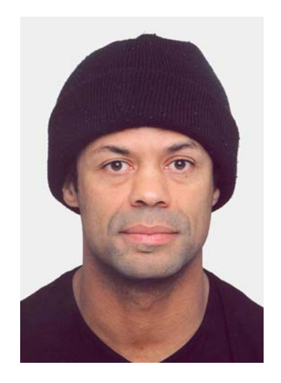
Not acceptable Hats are not permitted