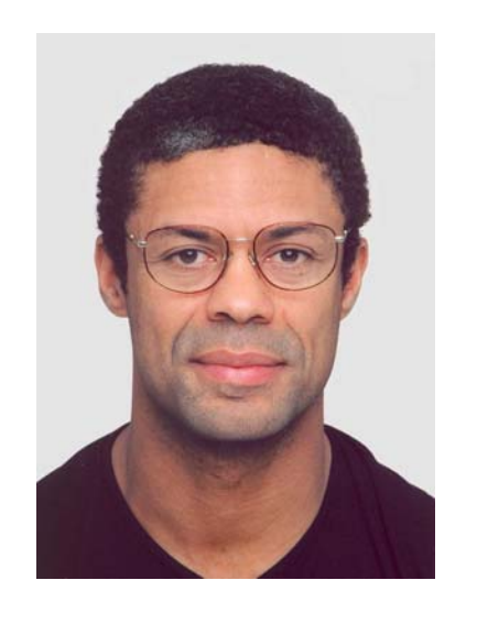
Acceptable Where possible, it is preferable to remove glasses to avoid any possibility of your photo being rejected