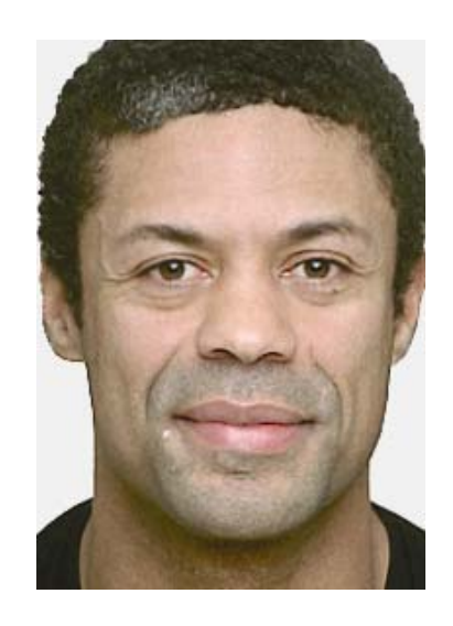
Not acceptable The subject is too close to the camera