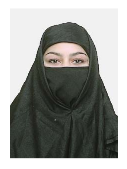
Not acceptable Covering of facial features is not permitted