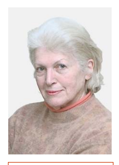
Not acceptable Portrait style photographs are not permitted