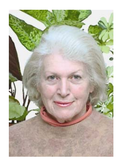
Not acceptable The background is not light grey or cream