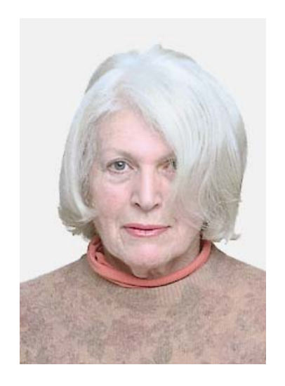
Not acceptable Hair covering the face is not permitted