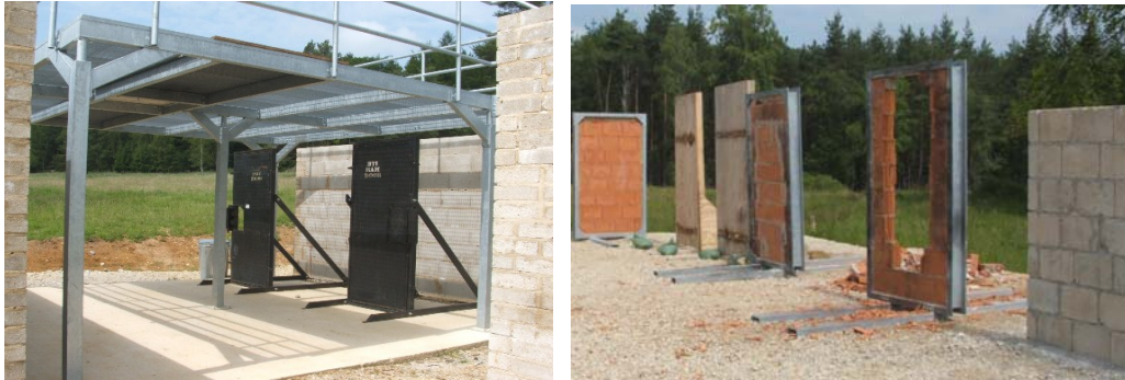
MoE isolated stands.

0624. Method of Entry (MoE) Techniques. Specially constructed doors and windows may be required to practice forced entry techniques either on or adjacent to fixed ranges. To use realistic MoE it is often better to provide isolated training structures away from the urban range.