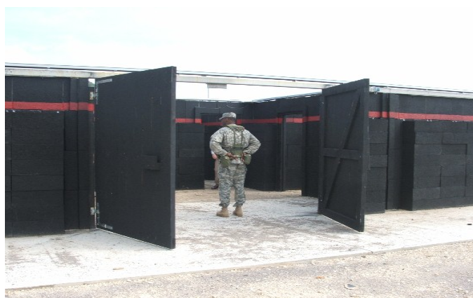
Example - Dura Block™ System using bonded tiles and blocks.

e. Rubber Panel & Block Systems. A shredded or vulcanised rubber tile over armoured steel plate system is a common proprietary wall system suitable for all natures upto 7.62mm. Rubber tiles bonded directly to steel plate may present a fire and maintenance problem if sited in areas where regular shot is expected. Tiles provided with a gap between the steel and rubber tile are suitable for judgmental bullet catchers but the gap extends the depth of wall presenting safety issues on external corners. Target areas or predicted impact areas where bonded panels are used may be protected with a 2nd layer of blocks in front of the structure to capture most rounds fired and allowing block rotation as the blocks become loaded with lead bullets.