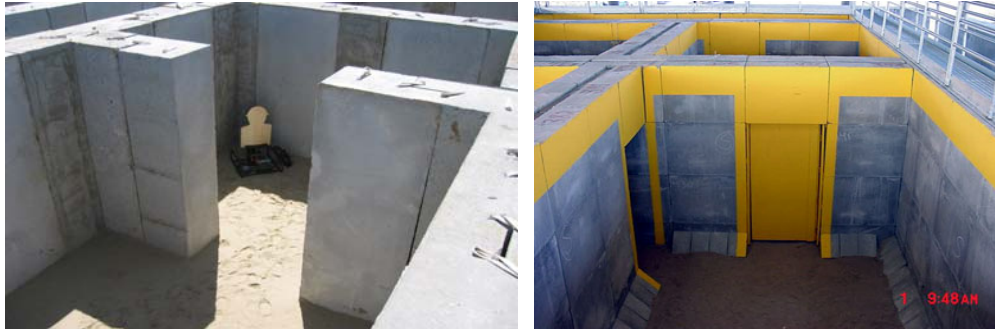
TARCON interlocking panels.

c. Tarcon (Turkey) Similar to SACON without the lead leaching inhibitor. Less expensive than SACON.