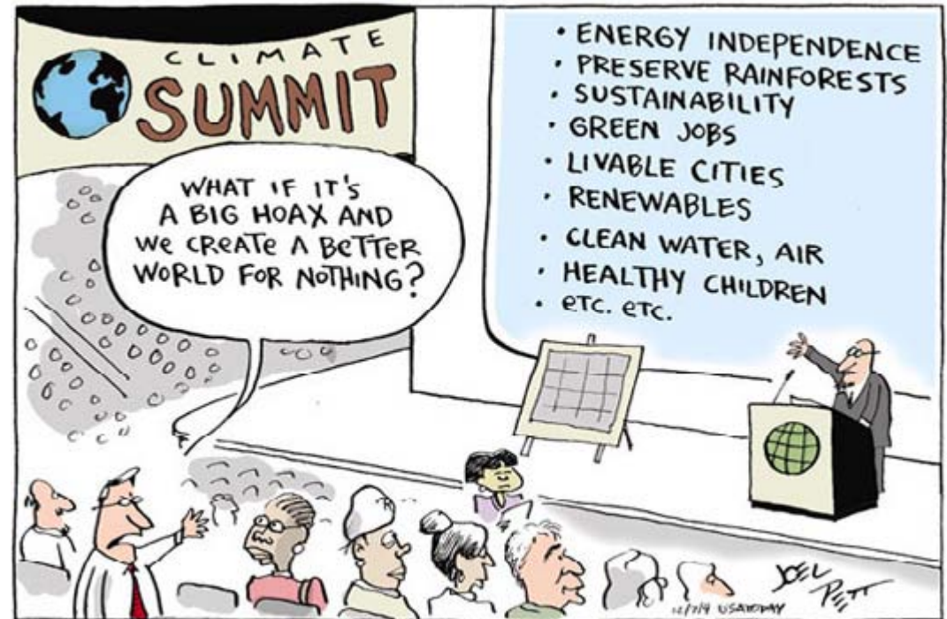
USA Today published this cartoon just before the 2009 Climate Change Conference in Copenhagen (© Joel Pett)