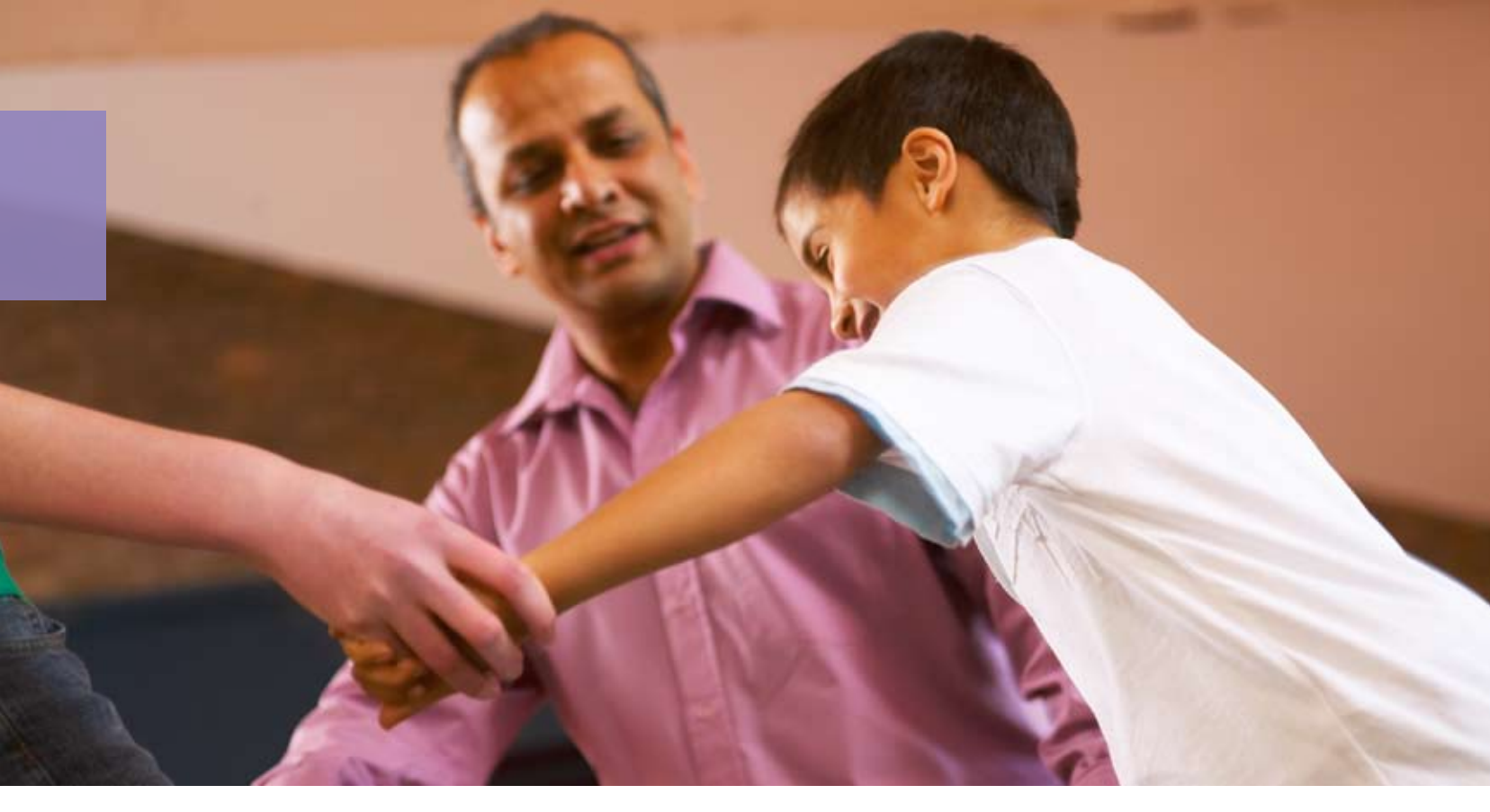
When there are children involved it's everyone's business **