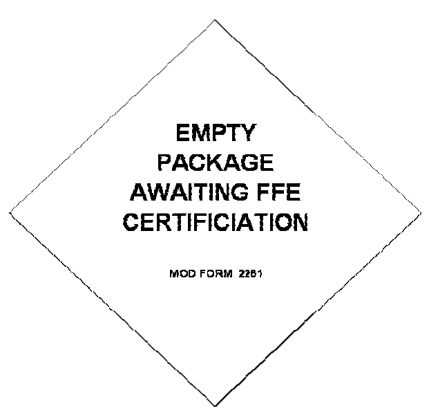
Figure 2 – MOD Form 2261 – Empty packages Awaiting FFE Certification.