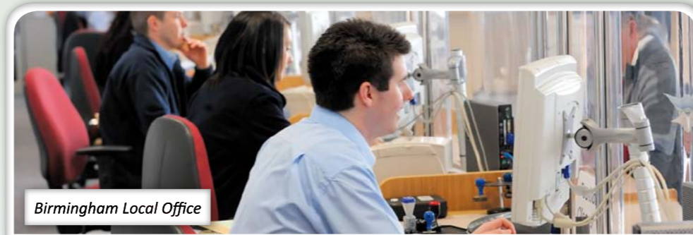
Birmingham Local Office

Customers will be able to transact with us electronically throughout the Christmas period at www.direct.gov.uk/motoring Opening times for our local offices and contact centre can be found below: