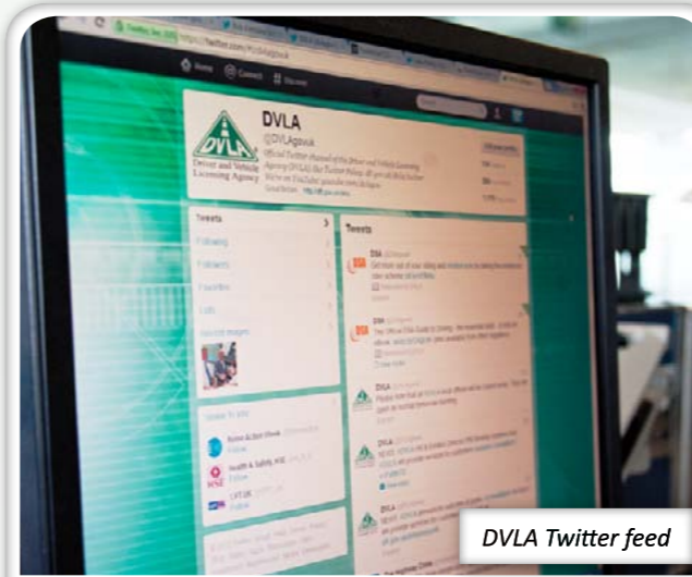
DVLA Twitter feed