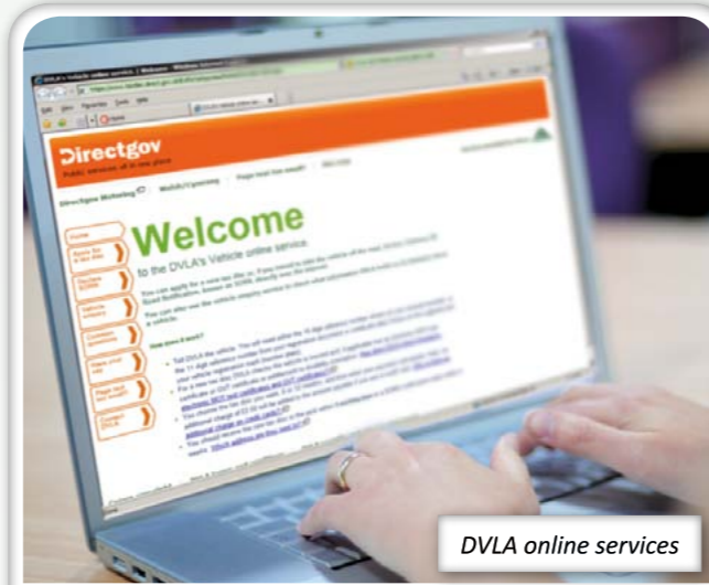
DVLA online services