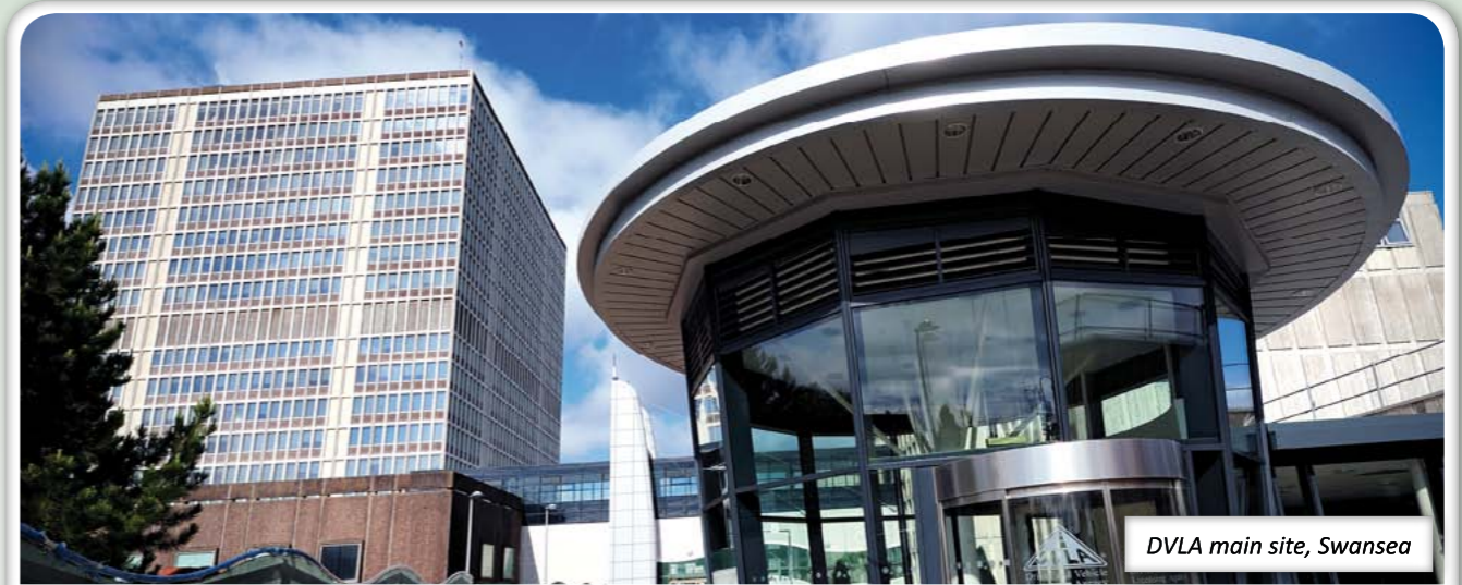
DVLA main site, Swansea