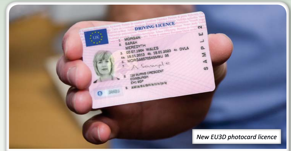
New EU3D photocard licence

All literature is also available in Welsh.