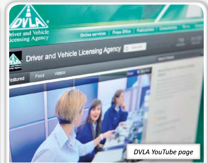
DVLA YouTube page