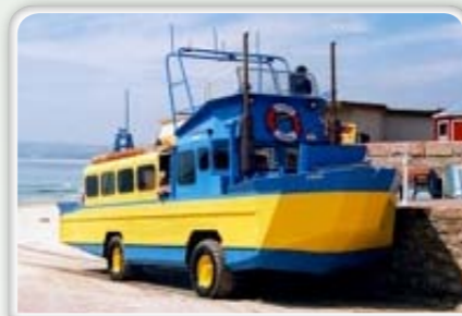
Puddle Duck Valiant

Some of the more unusual makes, included: