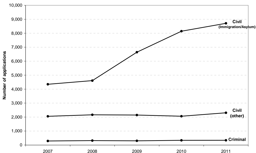
Figure 2: Applications to apply for Judicial Review, by nature of review

In 2007, 14 per cent all applications were granted permission to proceed to a final hearing and 51 per cent refused. The remaining 35 per cent had other outcomes such as withdrawal, adjournment and resubmission. Similar values were found for applications lodged in 2008. Between 2009 and 2011, the percentage of application granted permission to proceed decreased to 11 per cent in 2011 as these cases have had less time to work their way through the court system.