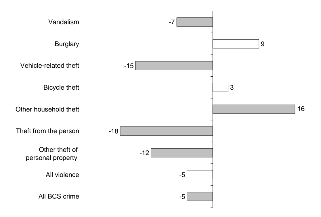
Figure 1 Percentage change in BCS crime based on interviews in the year to September 2010 compared with the previous year

Changes in Figure 1 which are statistically significant at the 5% level are indicated by a fully shaded bar. Other apparent changes are not statistically significant at the 5% level. Statistical significance for the change in all BCS crime cannot be calculated in the same way as for other BCS figures (a method based on approximation is used). See Section 8 of the User Guide to Home Office Crime Statistics (Home Office, 2010) for more information on statistical significance.