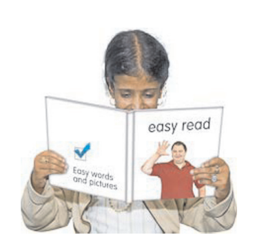
Easy Read version