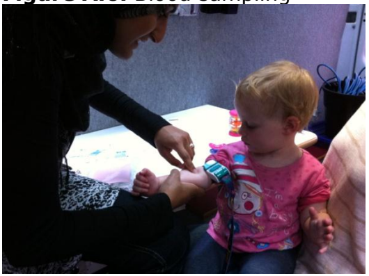
Figure A.6. Blood sampling

Each participant who took part in the blood sample component was awarded a certificate to acknowledge their contribution and bravery for having a blood sample taken.