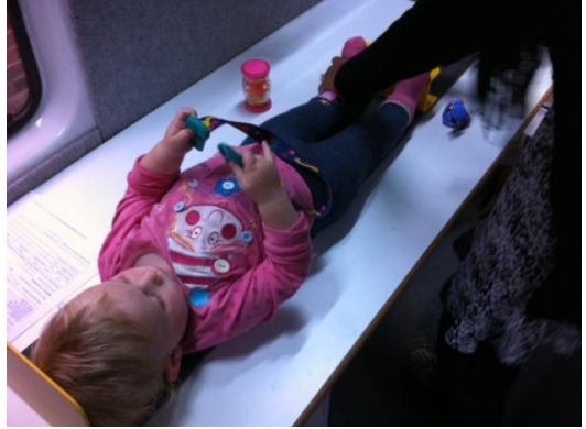
Figure A.2. Measurement of length

Occipito-frontal head circumference was measured using a Child Growth Foundation disposable head circumference tape<sup>16</sup>. The tape was placed around the child's head so that the tape lay across the frontal bones of the skull just over the occipital prominence at the back of the head (the widest part of the child's head).