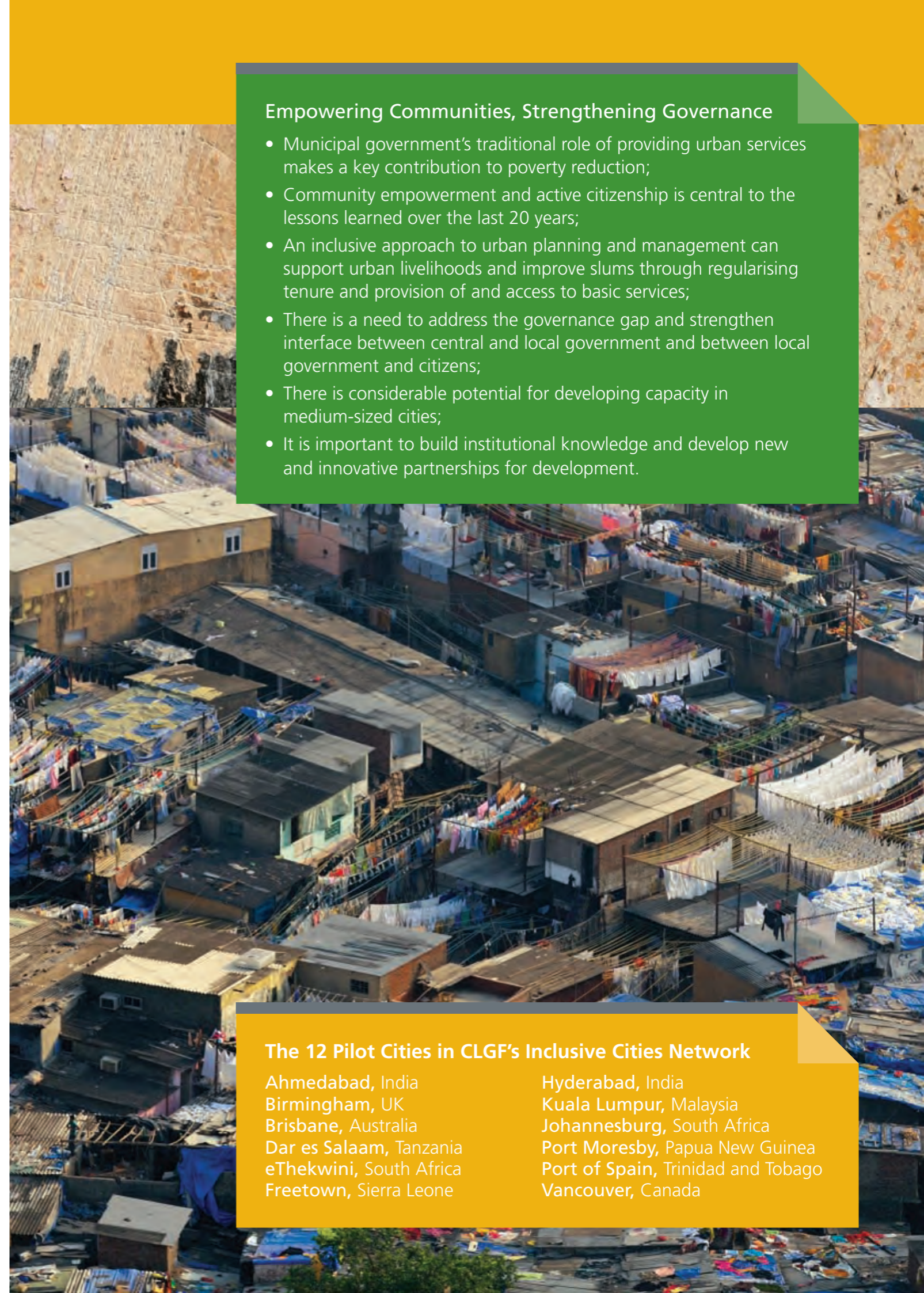
Right: View of a slum in South Mumbai, occupied by dhobi wallahs, (laundry workers) with washing drying on rooftops. Maharashtra, Mumbai (Bombay), India.

Empowering Communities, Strengthening Governance • Municipal government’s traditional role of providing urban services makes a key contribution to poverty reduction; • Community empowerment and active citizenship is central to the lessons learned over the last 20 years; • An inclusive approach to urban planning and management can support urban livelihoods and improve slums through regularising tenure and provision of and access to basic services; • There is a need to address the governance gap and strengthen interface between central and local government and between local government and citizens; • There is considerable potential for developing capacity in medium-sized cities; • It is important to build institutional knowledge and develop new and innovative partnerships for development.