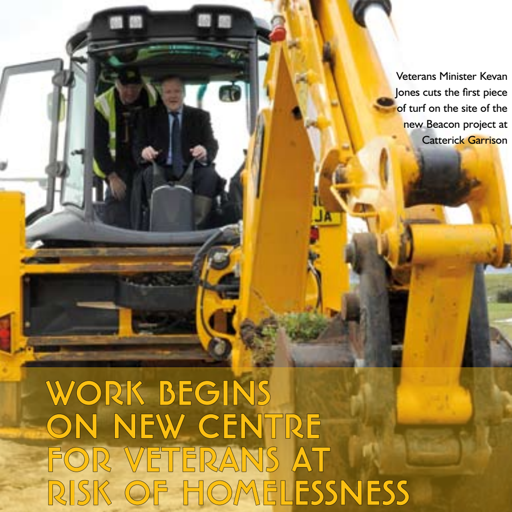
Veterans Minister Kevan Jones cuts the first piece of turf on the site of the new Beacon project at Catterick Garrison