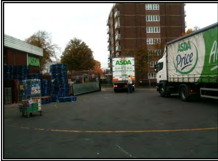
(FIG 7: The Asda Bloxwich delivery yard with residential flats opposite)