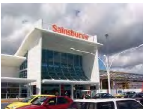
(FIG 2: Sainsbury’s Castlepoint store)

In addition, a “driver charter” was developed by Sainsbury’s to brief drivers on required practices when delivering to the store during the trial; this included an explanation of the trial, its purpose and a set of required driver actions (e.g. do not sound horn, switch off reversing alarms, switch off engines when not manoeuvring).