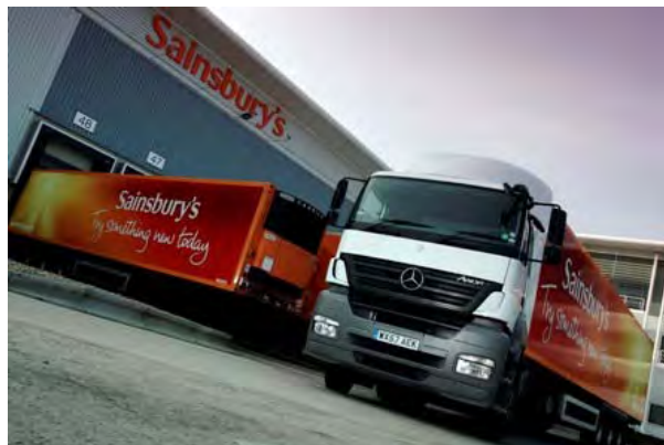
(FIG 1: Sainsbury's delivery vehicle)

A series of actions was agreed by the Working Group to further improve delivery practices and minimise associated noise. It was then agreed by all members that a trial would be feasible following implementation of simple noise mitigation measures.