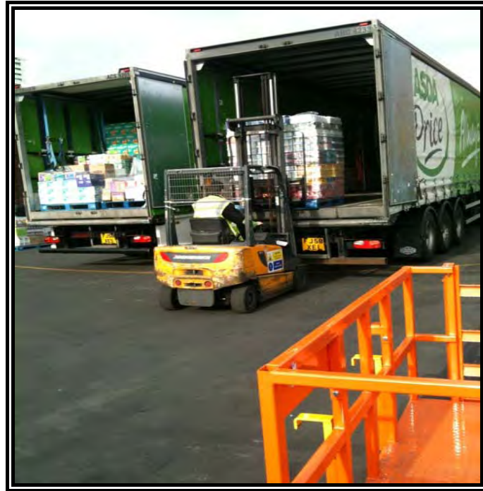
(FIG 8: Asda vehicles being unloaded)

Members of the Working Group agreed that the necessary actions could be taken to mitigate noise sources and improve delivery practices so that a trial could proceed.