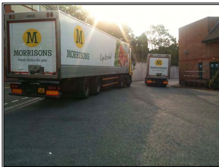
(FIG 5: Vehicles accessing the Morrisons Stone delivery yard)

The two deliveries that would form the focus of the QDDS trials were to be undertaken at 05.30 and 06.30 hours respectively. These would replace the two deliveries received at 07.00 hours. The first working group meeting took place on 11 June 2010 at the store itself, bringing all parties together for the first time to assess the potential for a trial, explain the background to QDDS and the methodology to be adopted, and agree the practicalities and timings of a trial.