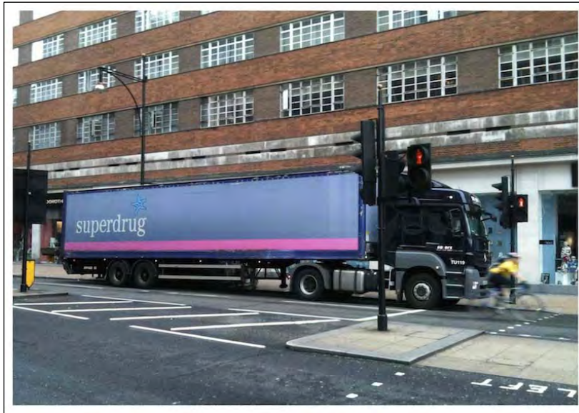
(FIG 9: Superdrug vehicle located outside Oxford St store)