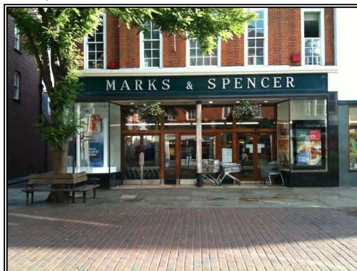
(FIG 3: The M&S store in Chichester)

Following discussions about the NAS report, members of the Working Group agreed and undertook to further improve delivery practices to minimise noise during the trial so as to avoid potential complaints from residents. Once these practices had been developed and introduced, members confirmed that a QDDS trial should proceed.