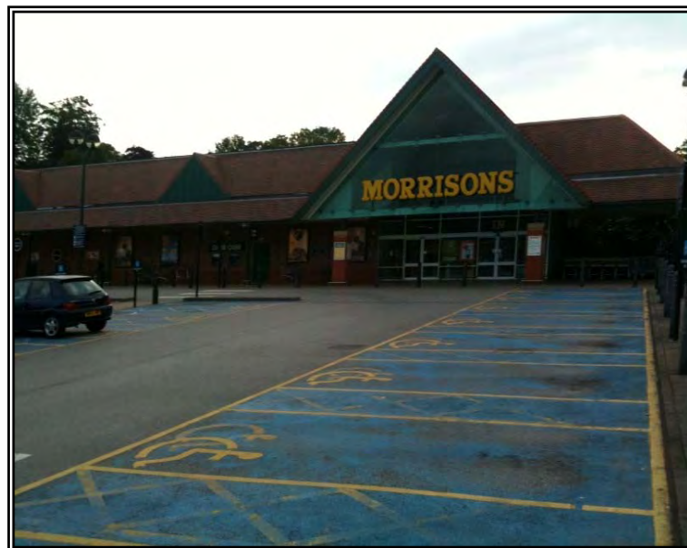
(FIG 6: Morrisons store, Stone)

In addition, Morrisons Transport Management prepared a “driver charter” of required driver behaviour both during and after the trial, emphasising the importance of the continuation of the new delivery times once the QDDS trial had ended.