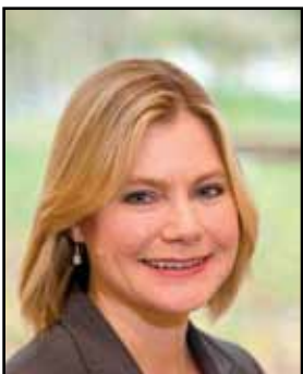
Justine Greening Economic Secretary to the Treasury, Her Majesty's Treasury