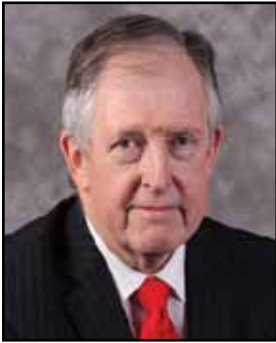
Rt. Hon Lord McNally