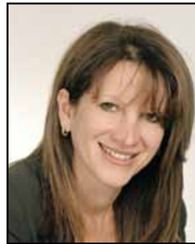
Lynne Featherstone Minister for Equalities, Government Equalities Office, Home Office