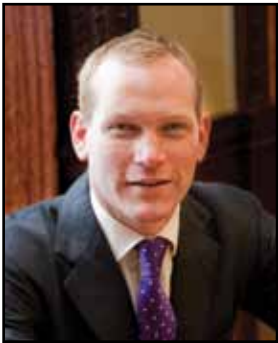
Jeremy Browne Minister of State, Foreign and Commonwealth Office