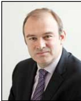
Edward Davey Minister for Employment Relations, Consumer and Postal Affairs, Department for Business, Innovation and Skills