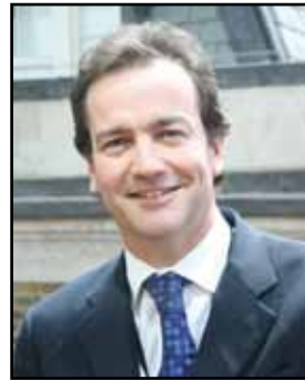
Nick Hurd Minister for Civil Society, Cabinet Office