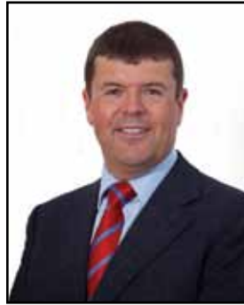
Paul Burstow Minister for Care Services, Department of Health