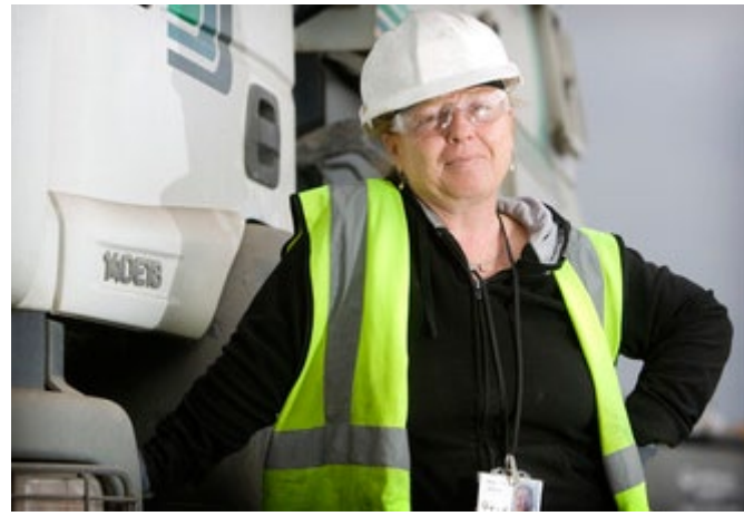
Employees on the Olympic Park.