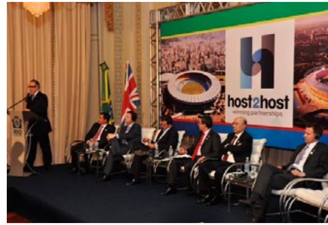
Maximising the power of the Games: Deputy Prime Minister, Nick Clegg, addresses delegates in Brazil as part of Host2Host.