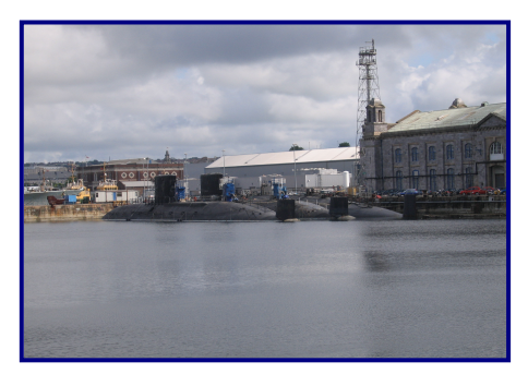
Laid-up submarines at Devonport

When a nuclear-powered submarine leaves service with the Royal Navy, the nuclear fuel is removed from the reactor and sent for long-term storage at the Nuclear Decommissioning Authority (NDA) site at Sellafield, Cumbria. Serviceable equipment is then removed for re-use. Currently, Babcock International at Devonport has the only nuclear licensed site in the UK with the capability to defuel nuclear submarines. By law, this work cannot be undertaken on a non-licensed site.