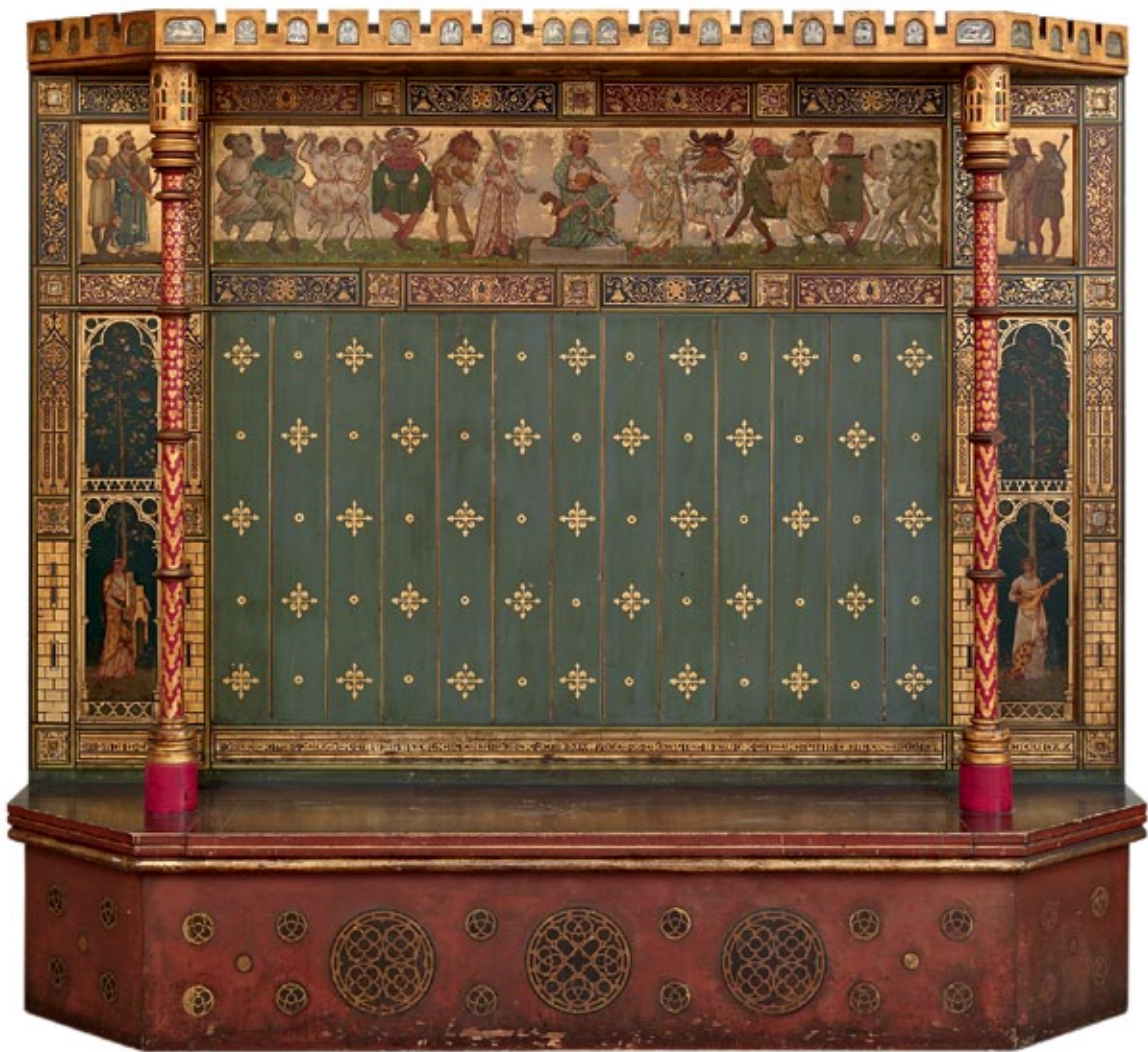
Plate V A zodiac settle by William Burges