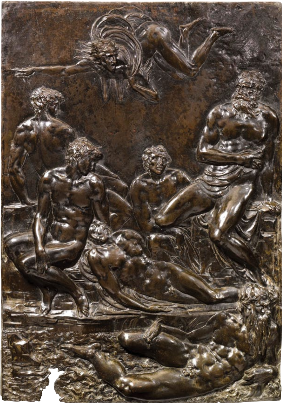
Plate IV A relief of Ugolino imprisoned with his sons and grandsons by Pierino da Vinci