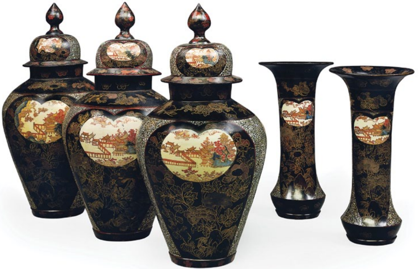
Plate X A lacquered Imari porcelain garniture