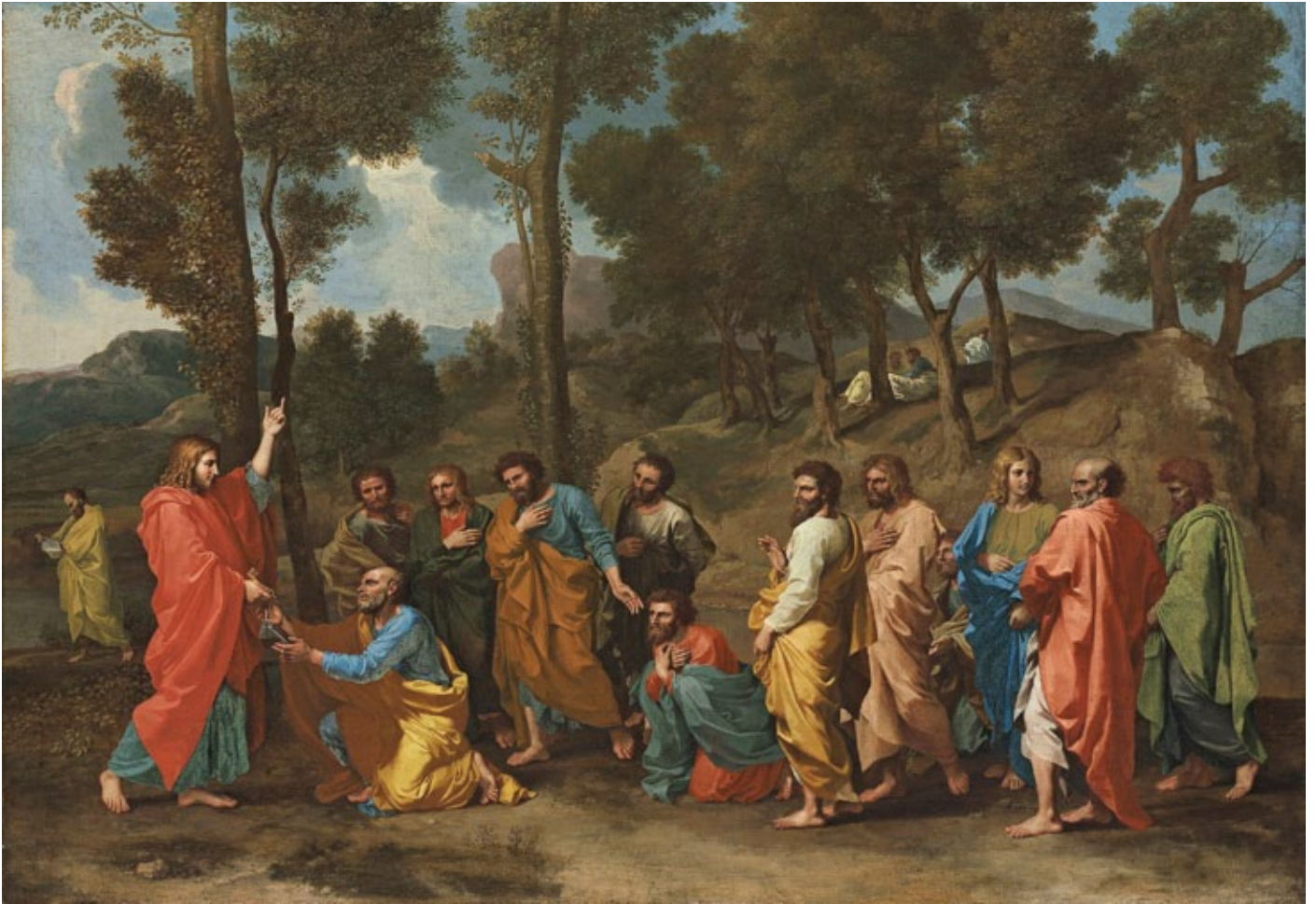
Plate XII A painting by Nicolas Poussin, Ordination