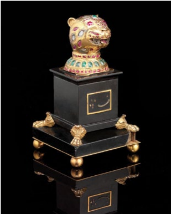
Plate II A gold gem set tiger's head final