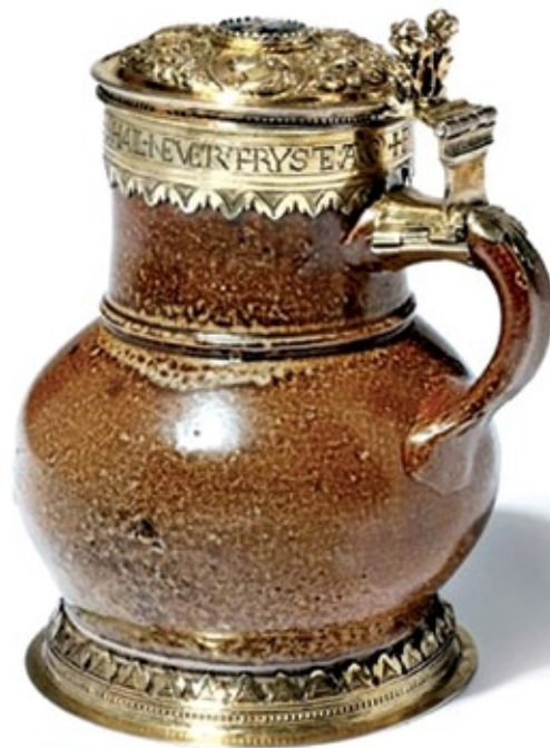
Plate III An Edward VI silver-gilt mounted Rhenish salt-glazed tankard