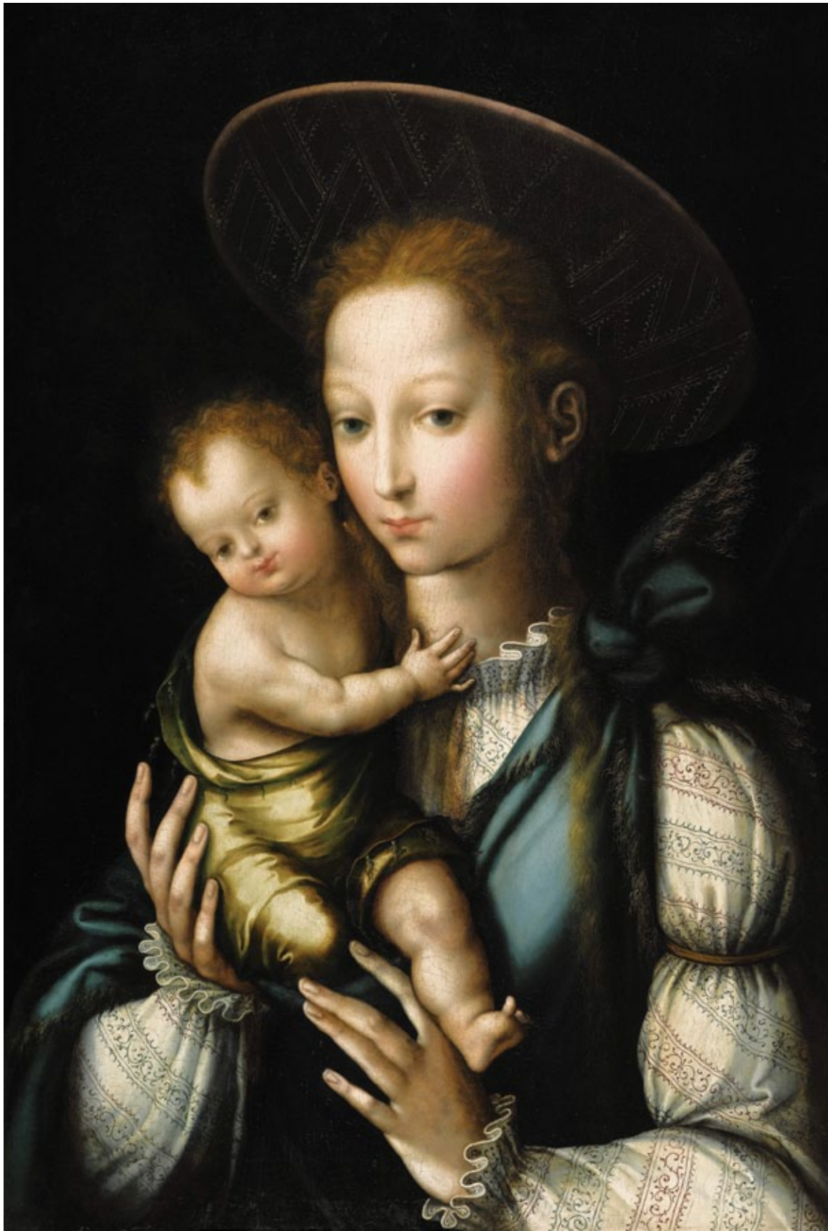
Plate XIV A painting by Luis de Morales, The Virgin and Child