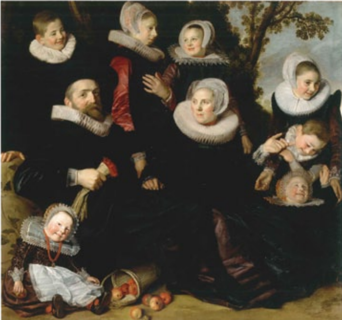
Plate XIII A painting by Frans Hals, Family Portrait in a Landscape