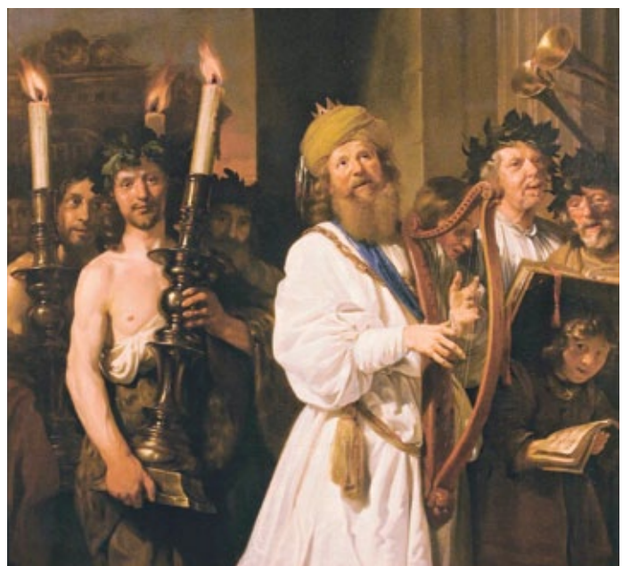
Plate VIII A painting by Jan de Bray, David and the Return of the Ark of the Covenant