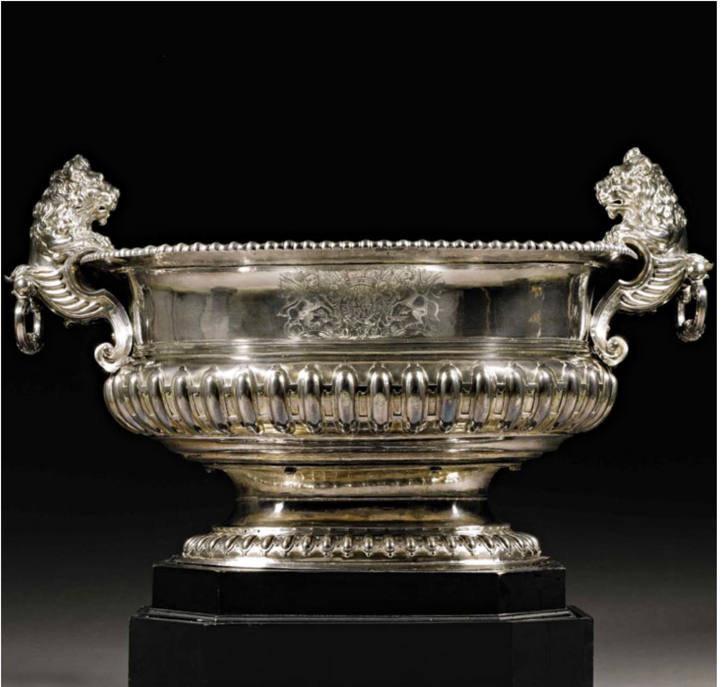
Plate IX The great silver wine cistern of Thomas Wentworth