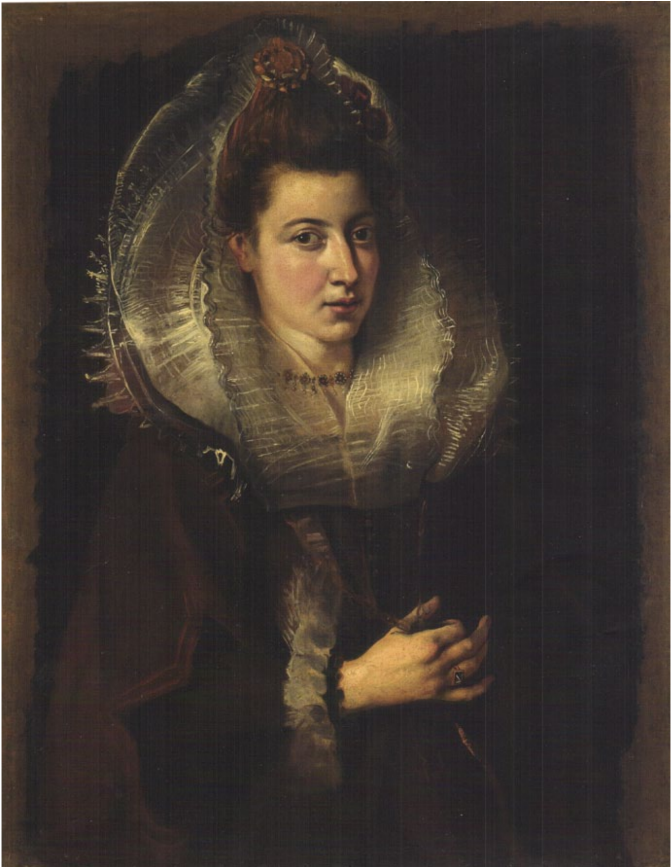
Plate I A painting said to be by Sir Peter Paul Rubens, Portrait of a Young Woman (2009/10)