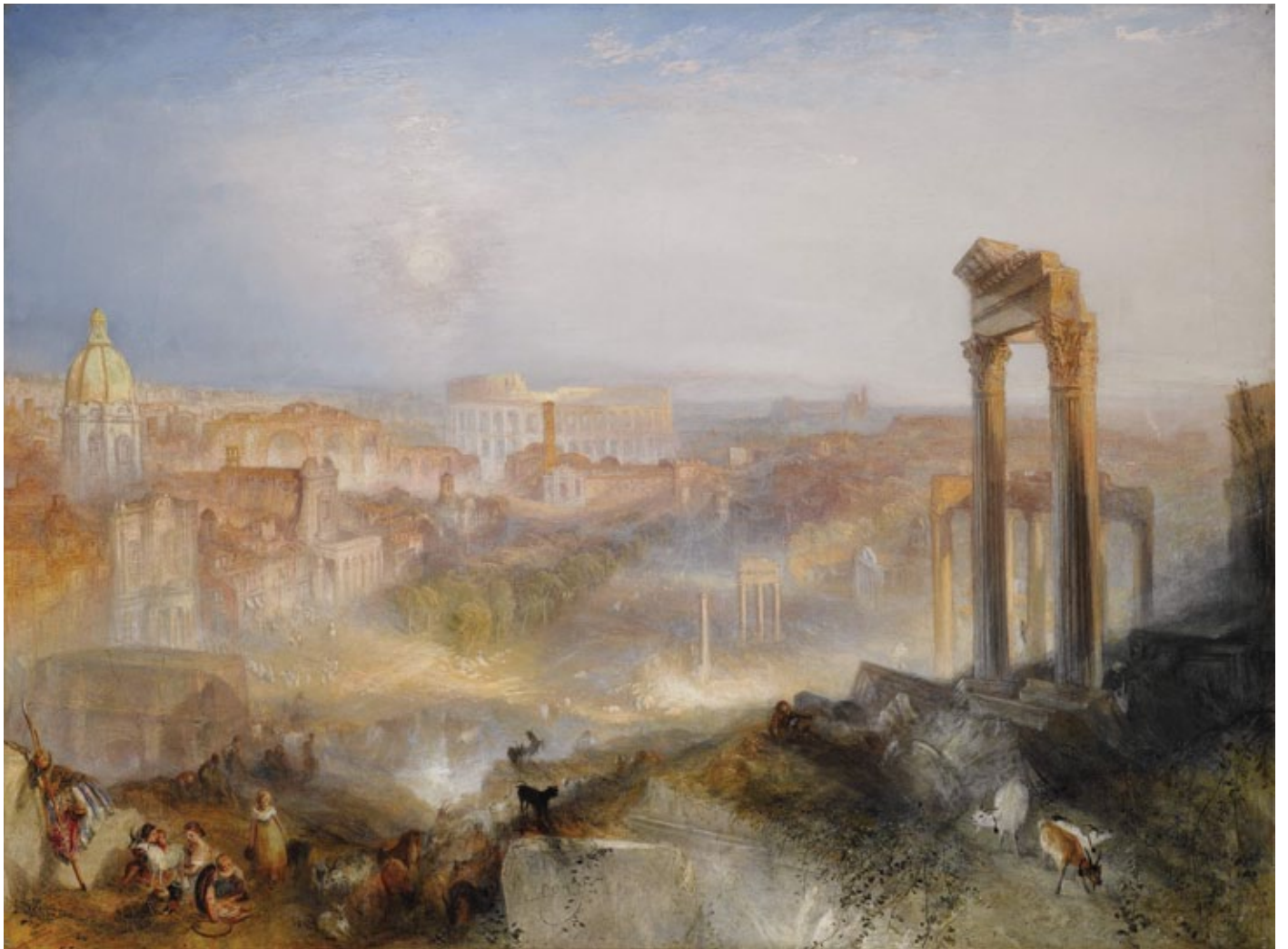
Plate VII A painting by Joseph Mallord William Turner, Modern Rome – Campo Vaccino