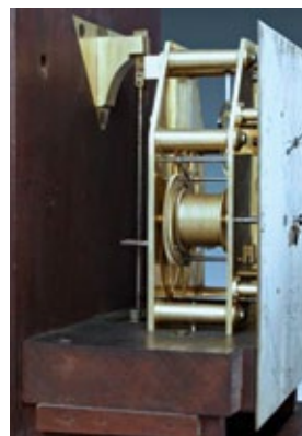
Plate VI An early 19th century regulator by John Roger Arnold