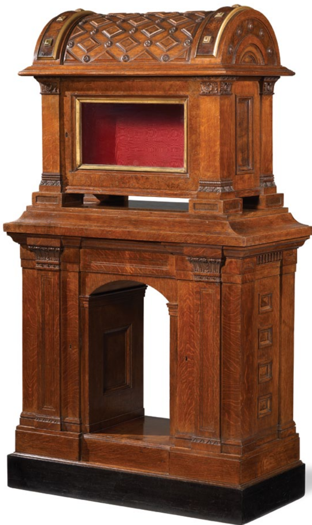
Plate XI A William IV cabinet on stand made for William Beckford