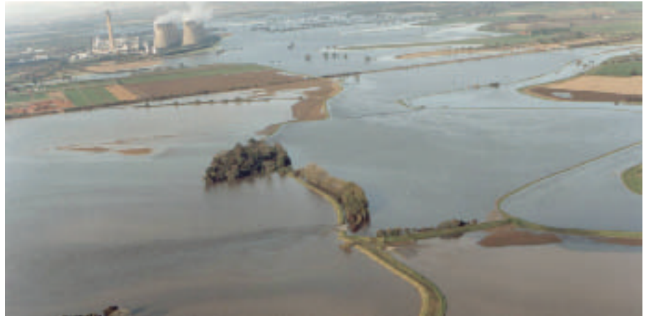
Media handling during floods was a key issue in Yorkshire & the Humber