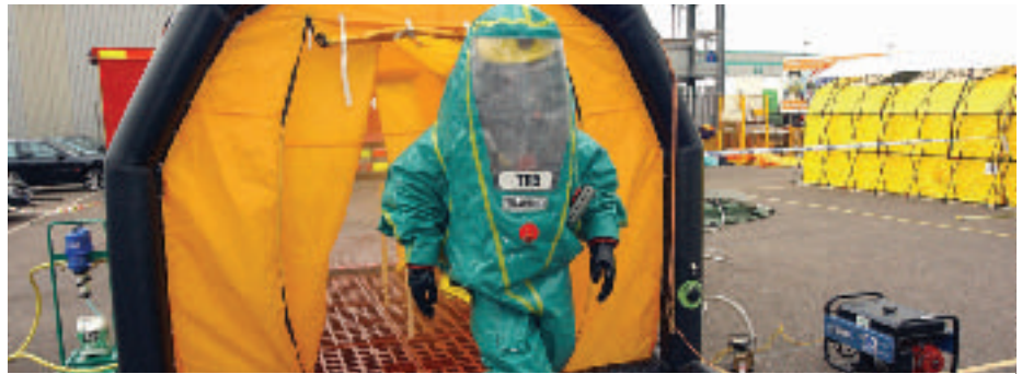
The New Dimensions launch in Leicester