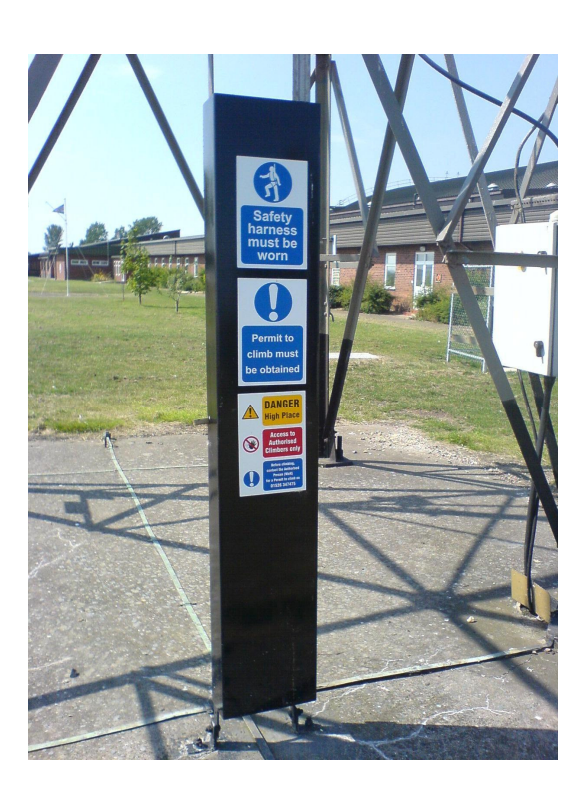
Fig 3 - Example of a typical anti-climb device on a fixed ladder