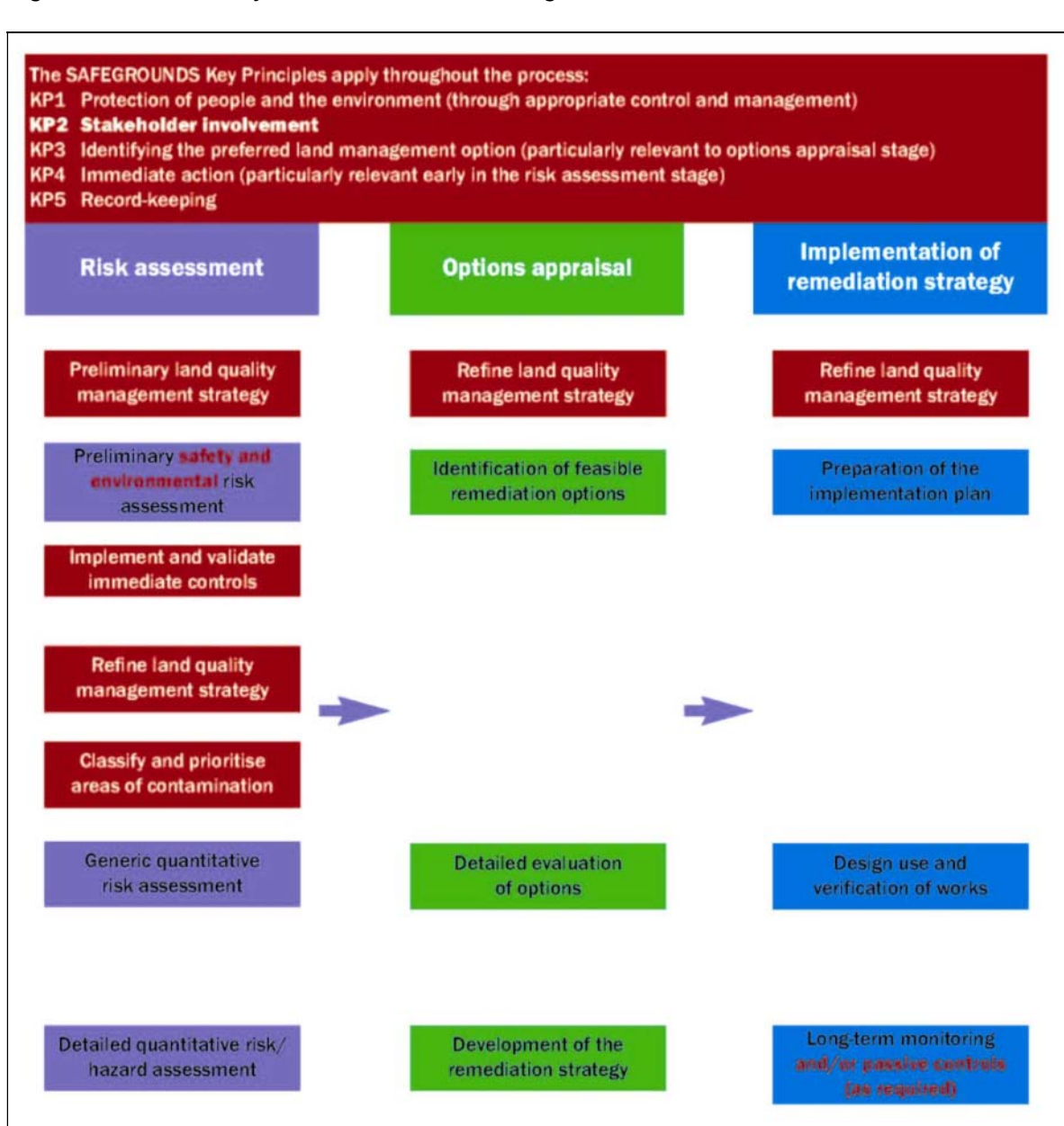
Figure 2 Land Quality Assessment and Management Process