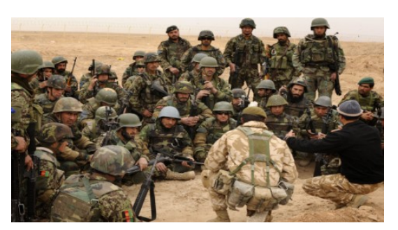
Tackling conflict overseas in the UK's national interest

Instability or conflict overseas can incubate direct threats to UK security. Where formal government is absent or weak, as in Somalia or Yemen, terrorism, organised crime and piracy can take root.