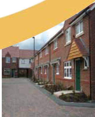
Danum St. Giles Doncaster

Shared Ownership 2, 3 & 4 bedroom houses available from February 2012