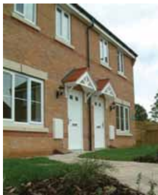
Greenfield Park Doncaster