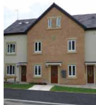
Leighton House New Mills