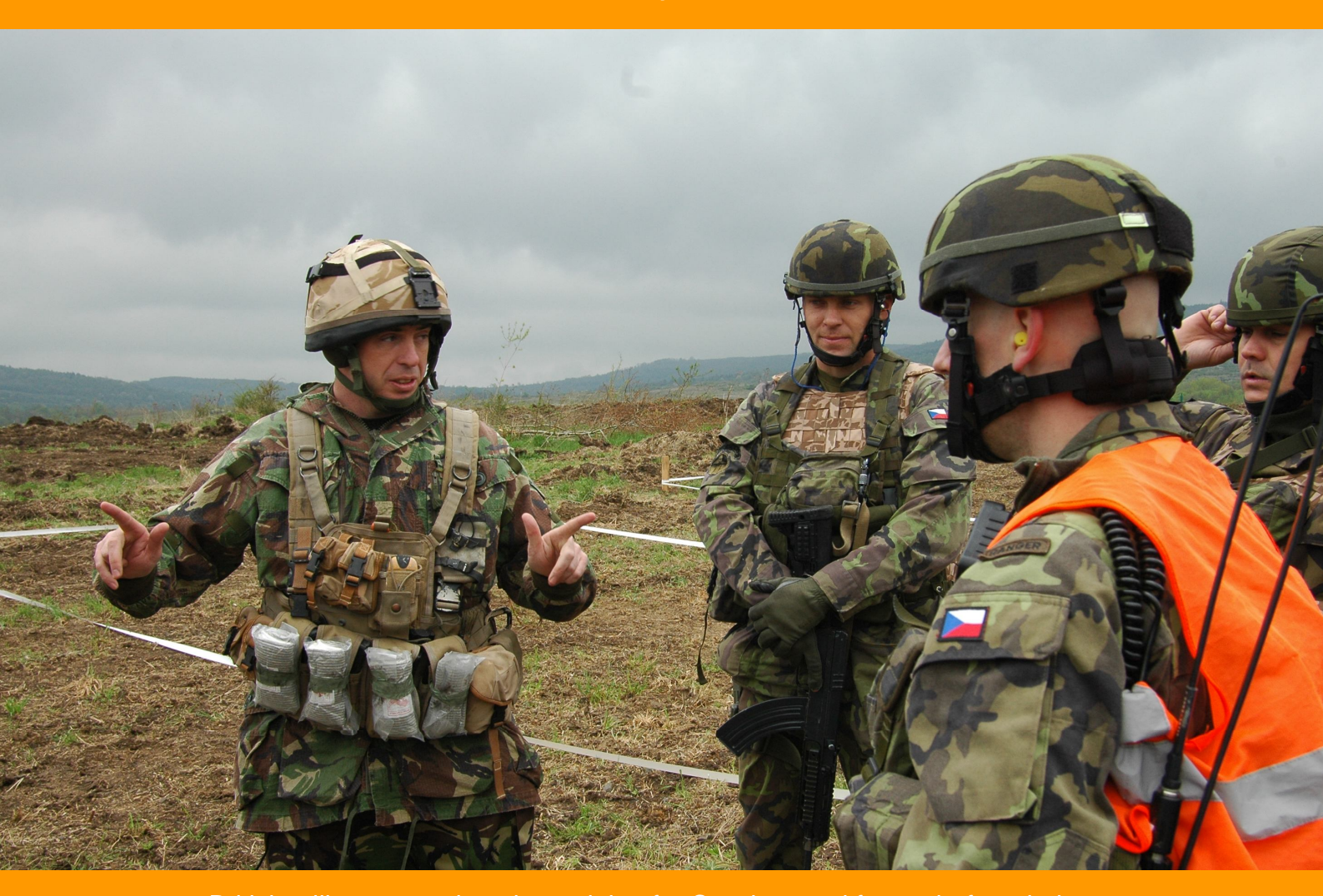
British military peacekeeping training for Czech armed forces before their deployment to Afghanistan.