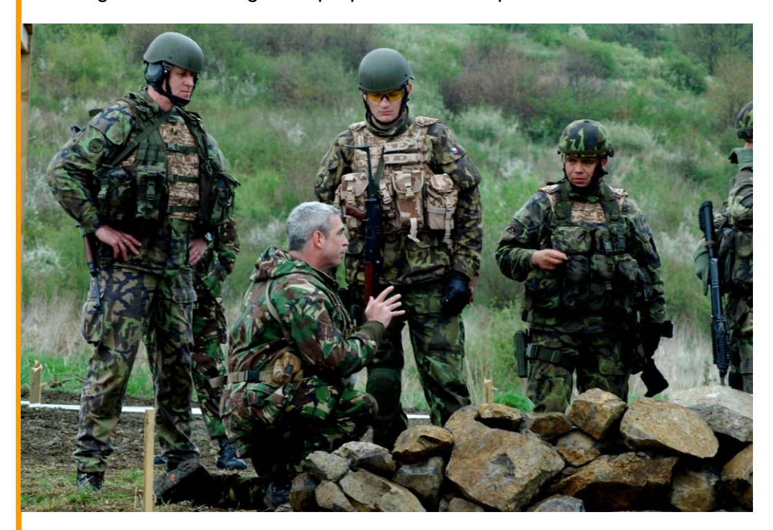
British military trainers delivering pre-deployment training to future peacekeepers.

The training included a six-week package on individual low-level skills and a tenday intensive Skill at Arms session, designed around combat scenarios the contingent is likely to encounter in Afghanistan. It ended with a mission rehearsal exercise in Hohenfels, Germany, where they joined the US contingent with which they will be working. The first Czech OMLT deployed to Wardak Province in late August 2010. BMATT(CZ) also assisted the second Czech contingent when it began its preparations in September.