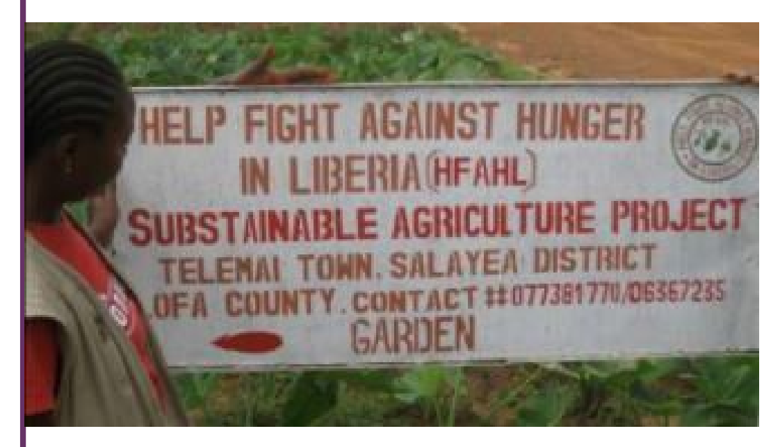
HFAHL was founded by a group of students who had completed the Conflict Pool funded Agricultural Training Programme.

The founding members fought for Liberians United for Reconciliation and Democracy (LURD) during the Liberian Civil War and were unable to reintegrate peacefully into society post-war until TATP provided an opportunity to change and support the development of their own community.