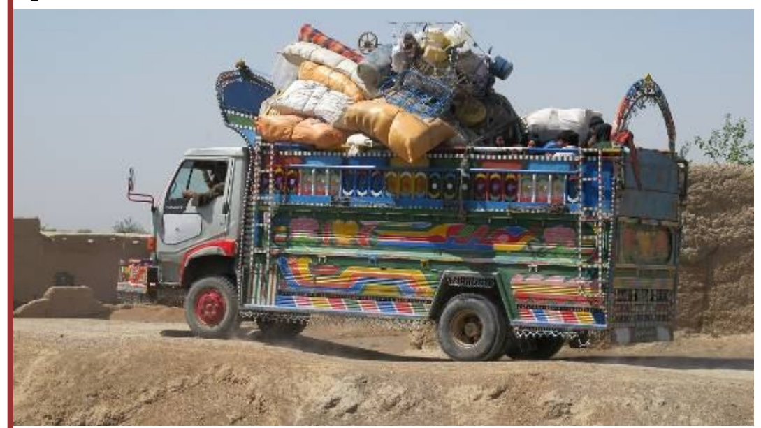
MSSTs oversaw the safe return of refugees to Zorabad, while Conflict Pool projects helped reestablish a working community and trust in government.

Further plans include projects to provide clean water, repairs to damaged buildings and new footbridges to improve access to the Bazaar. Using local labour, these projects will help mark a welcome return to normality, while the community of Zorobad continue to see a clear and direct benefit from their own government.