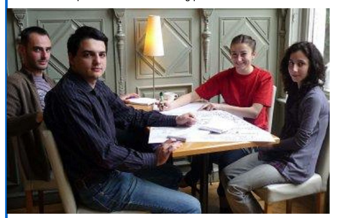
It's good to talk: young adults cross the divide through discussion and debate.

Opportunities for direct contacts across the conflict divide are rare, leading to stereotypes and misperceptions in both societies. Confidence-building measures had been further hampered by the conflict of August 2008. The project recognized the importance of keeping open channels for communication and that the current situation offered potential for new internal debate. A key element of the work of the project during 2009/10 was a study trip to Northern Ireland, where participants were able to develop strategies on working within their own societies to make them more conducive to constructive processes towards long-term conflict settlement. Participants were able to explore the similarities between the Northern Ireland and Georgian contexts in meetings at Stormont with politicians from both ruling parties.