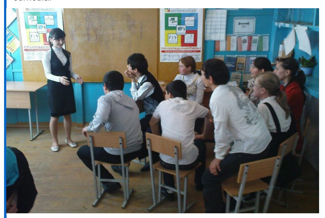
Encouraging young people to speak out and debate long-standing issues.

In Ingushetia, YLPN youth activists took part in the TV programme Ingush Traditions, Customs and Prospects of Youth Development, where they discussed their understanding of youth problems with elders and clergy. Hundreds of young people, teachers and social workers in the three republics also took part in Discussion Video Clubs (DVCs), where they could speak out and debate long-standing concerns. Teachers' reports noted the positive impact that the YLPN had on participants. Subsequently, universities in Chechnya and Dagestan decided to use the YLPN DVC methodology as an integral part of their curricula.