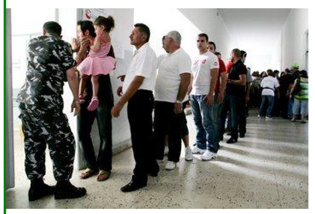
Lining up to vote in Zgharta – Conflict Pool support ensured the elections passed peacefully.

Drawing on their experience of major event policing and a nationwide risk assessment, the Metropolitan Police Service helped the Ministry of Interior and Municipalities and the Lebanese Armed Forces deployed resources to constituencies judged to be most at risk of violence. The elections passed peacefully and the Ministry effectively adapted the planning methodology for the municipal elections that followed.