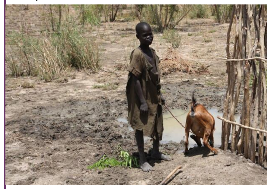
A local Dinka boy feeding one of his family's goats at the new borehole outside Agok.

In response to the immediate provision of a sustainable water supply and positive impact of community participation in peacebuilding activities, the UN and the Sudanese Government called for a comprehensive water supply programme in January 2010.