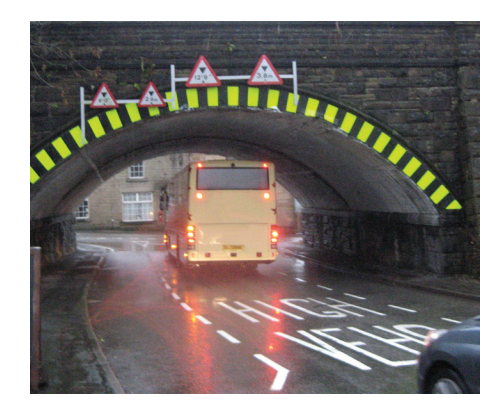
White lines on the road and 'goal posts' on the arch indicating the extent of the signed vehicle height limit

At arch bridges, white lines on the road and 'goal posts' on the bridge may be provided to indicate the extent of the signed limit on vehicle height, normally over a 3 metre width. There may be an additional set of 'goal posts' showing lower limits towards the kerb.