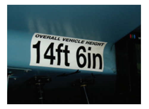
Notice in a driver's cab displaying the overall vehicle height

The Road Traffic Act 1988 requires any road traffic collision that causes damage to a 3<sup>rd</sup> party to be reported. Each bridge strike will cause damage to a bridge, and must therefore be reported.