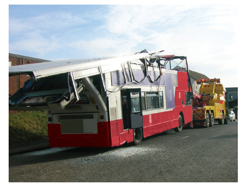
Recovery of a damaged bus following a bridge strike