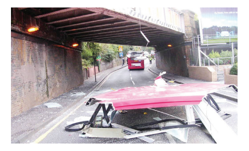
A bridge strike involving a rail replacement bus