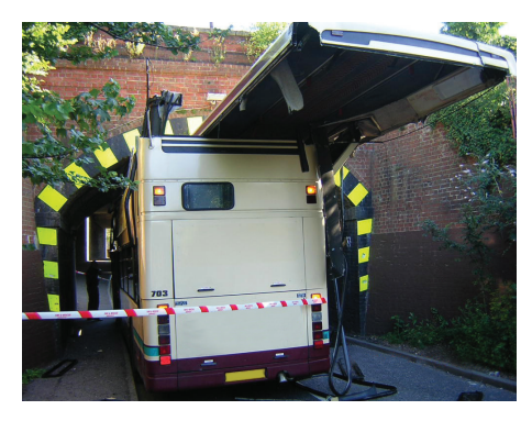
Passengers on the upper level of a bus are at particular risk of injury