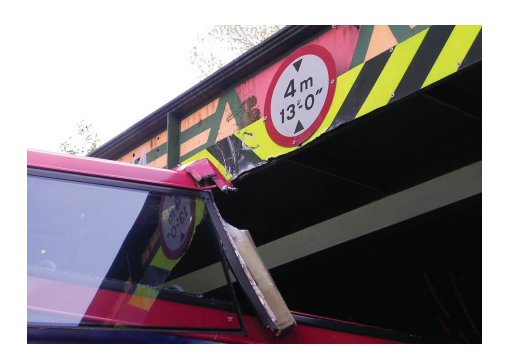
The result of a bus being driven off route

This guide has been produced by organisations representing the passenger transport industry in conjunction with Network Rail.