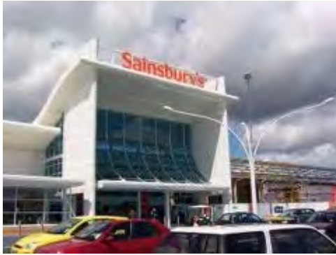
Figure 1: Sainsbury's Castlepoint store

The QDDS methodology was introduced and all the necessary pre-trial steps were taken (e.g. development of an MoU, the introduction of a telephone helpline, set up of noise monitoring equipment) and the trial officially started on 31 May 2010. In addition, the trial also involved direct suppliers of products (e.g. bread, milk) to the store who were asked to introduce and comply with the same actions being undertaken by Sainsbury's own staff in terms of implementing quieter delivery