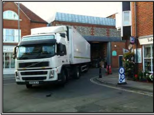
Figure 2: M&S Chichester Store delivery

The trial officially started on 16 August 2010 with M&S Logistics Department and M&S store staff instructing and training staff on quieter delivery practices. The trial ran for 6 weeks and formally concluded on 27 September 2010, when a QDDS post-trial meeting was held to review the trial itself and to agree next steps.