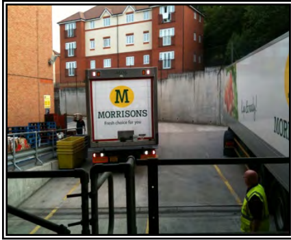
Figure 3: Morrisons delivery yard

This QDDS trial was the first trial to generate complaints via the telephone helpline, with 3 complaints received from residents who lived in a block of flats located opposite the Morrisons delivery yard. In all instances, the complaints focused on noise from the delivery process (e.g. arrival of vehicle) and the necessary remedial procedures were taken to address the complaints. Details of each complaint were circulated to members of the