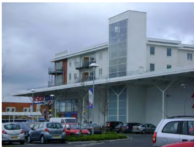
Figure 6: Tesco Reading with residential above

Reading Borough Council to 'host' a trial, the Consortium decided to prioritise an application for Tesco Reading.