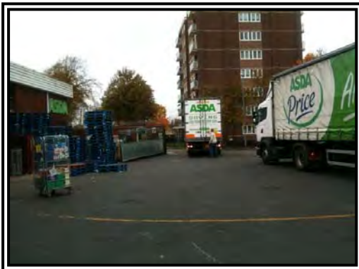
Figure 4: Asda delivery yard

The trial between Asda and Walsall Council, for the Asda store in Bloxwich, took place from December 2010 to January 2011. Investigations showed that a voluntary agreement existed between the store, local residents and Walsall Council so that no deliveries should be undertaken before 07.00 hours and after 22.00 hours, to protect residents' interests. However, Asda were keen to have this relaxed, subject to agreement by all parties, in order to