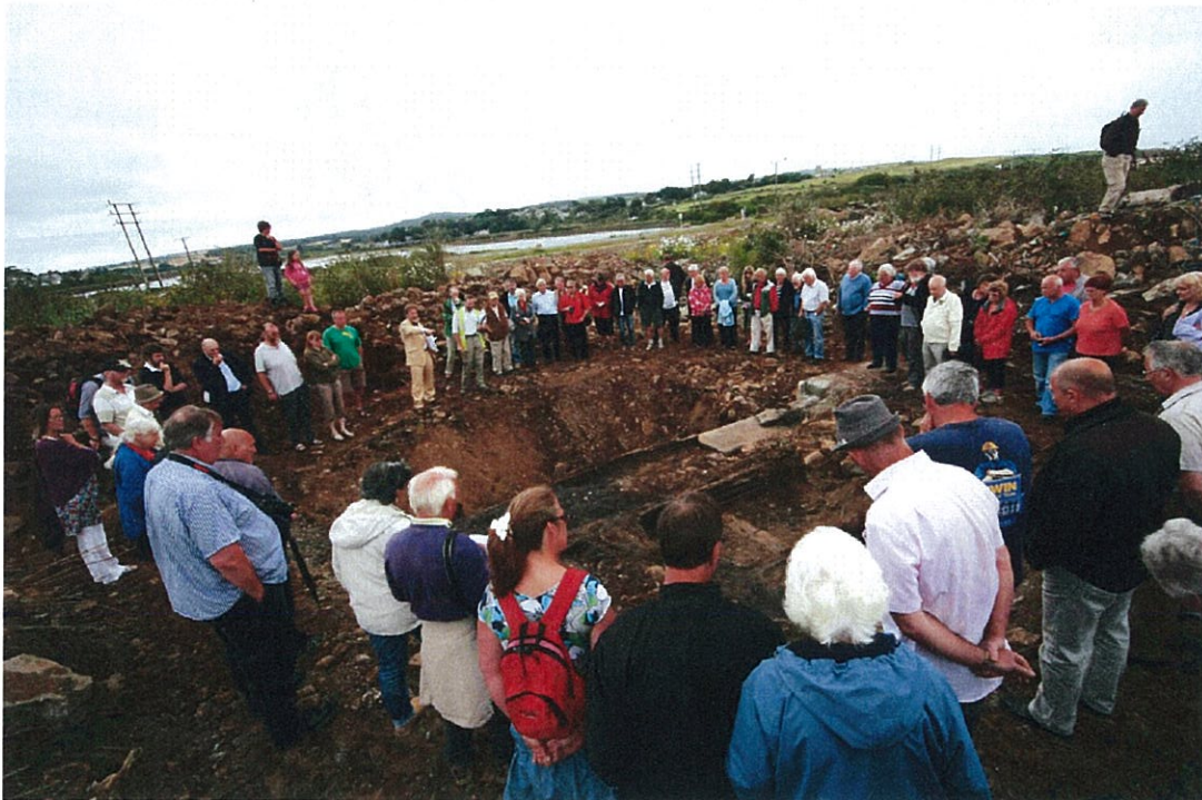
Residents taking part in the walk around South Quay

The Walk was declared a success by those who took part and allowed people to see for themselves the wooden slipways and granite docks, which were uncovered by the Archaeology team working on South Quay